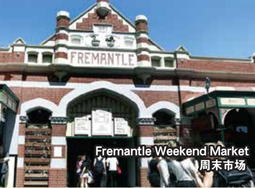
Fremantle Weekend Market 周末市场