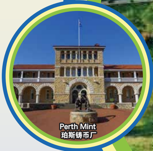
Perth Mint 珀斯铸币厂

行程次序，以当地旅社安排为准。 Sequences of Itinerary are subject to local arrangement.