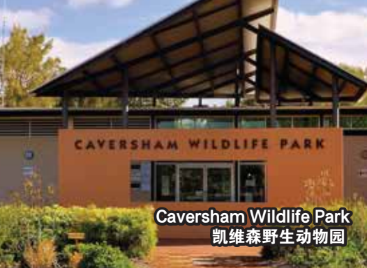
Caversham Wildlife Park 凯维森野生动物园