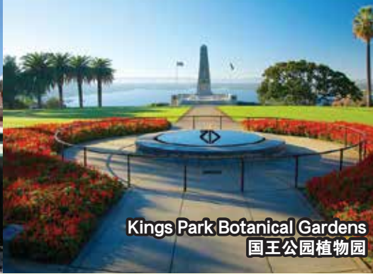
Kings Park Botanical Gardens 国王公园植物园