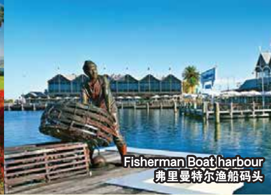
Fisherman Boat harbour 弗里曼特尔渔船码头