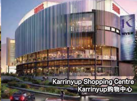
Karrinyup Shopping Centre Karrinyup购物中心