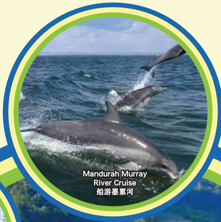
Mandurah Murray River Cruise 船游墨累河