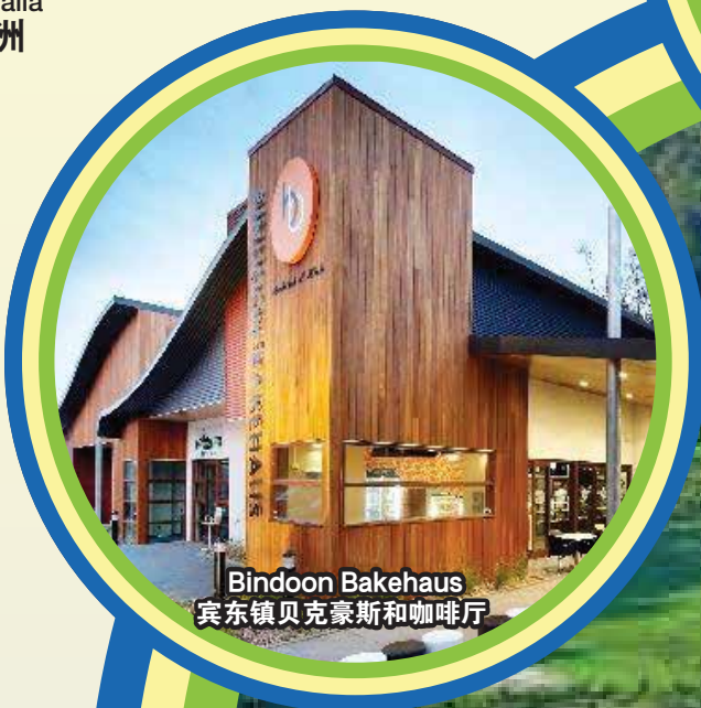
Bindoon Bakehaus 宾东镇贝克豪斯和咖啡厅