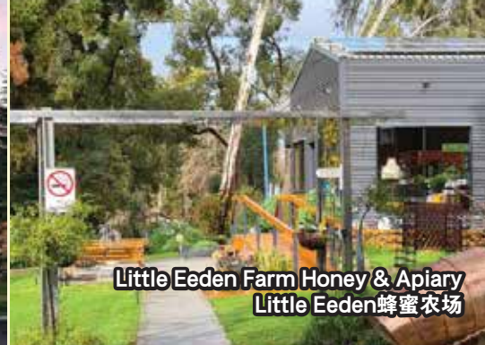
Little Eeden Farm Honey & Apiary Little Eeden蜂蜜农场