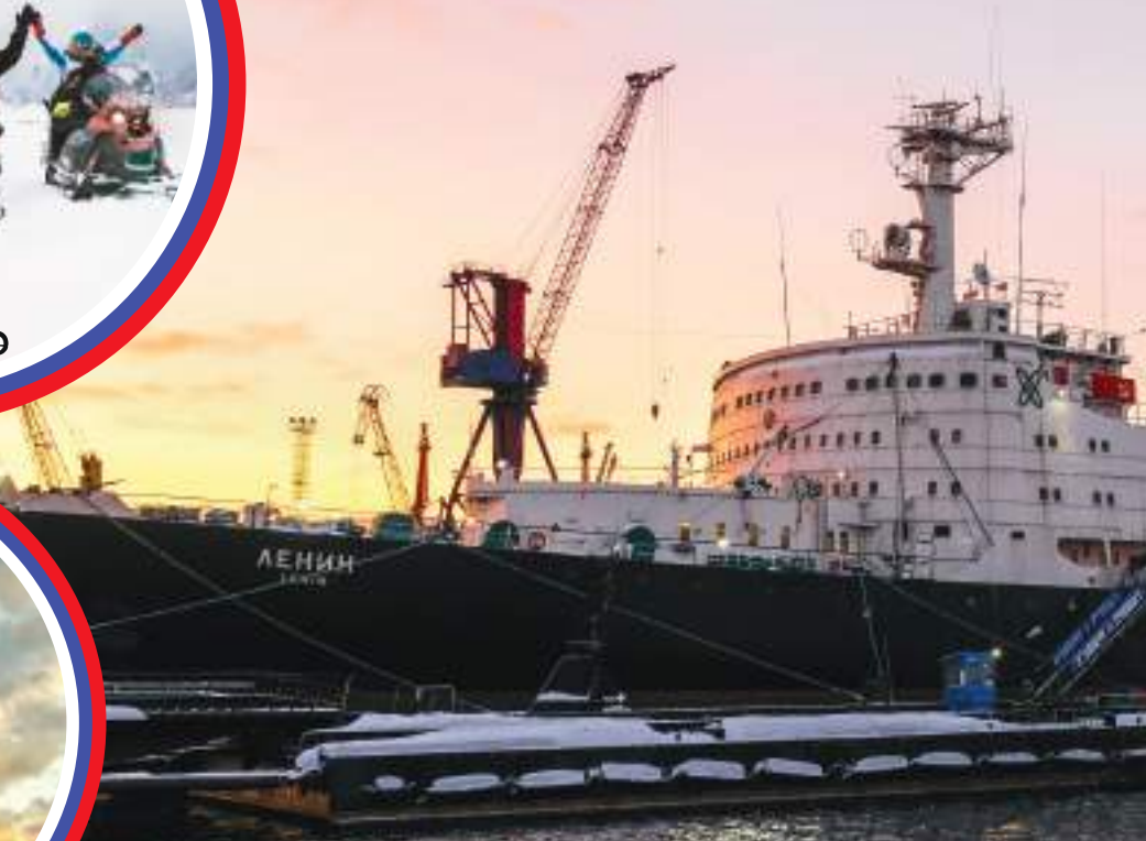
Nuclear-Powered Icebreaker "Lenin"