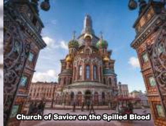
Church of Savior on the Spilled Blood