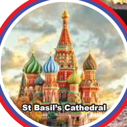
St Basil's Cathedral