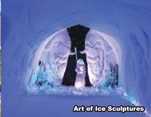
Art of Ice Sculptures