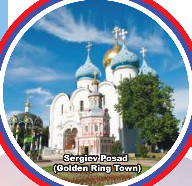
Sergiev Posad (Golden Ring Town)