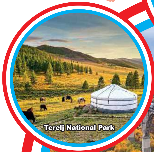
Terelj National Park