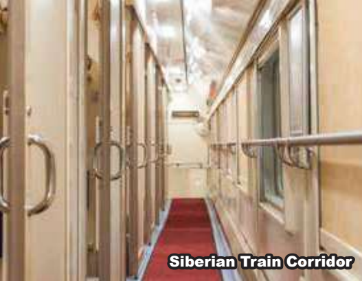
Siberian Train Corridor