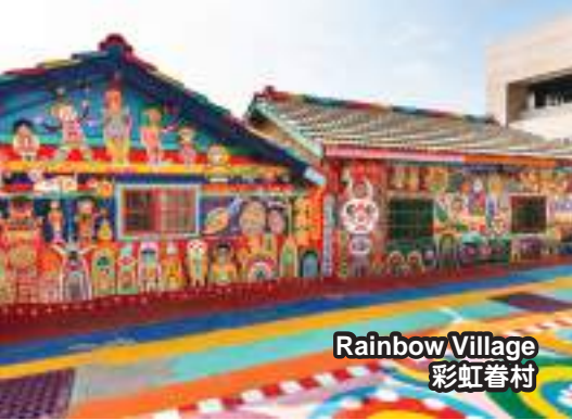
Rainbow Village 彩虹眷村