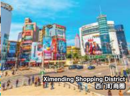
Ximending Shopping District 西门町商圈