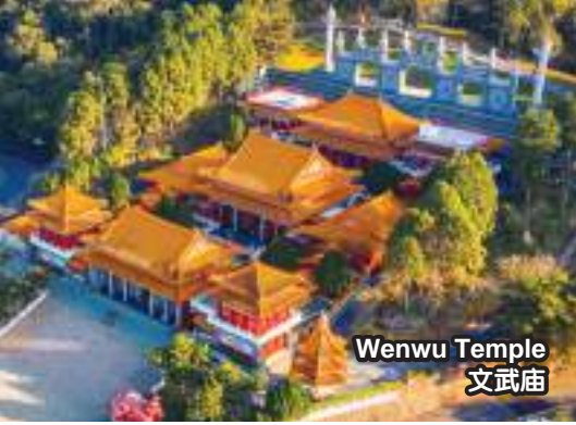
Wenwu Temple 文武庙