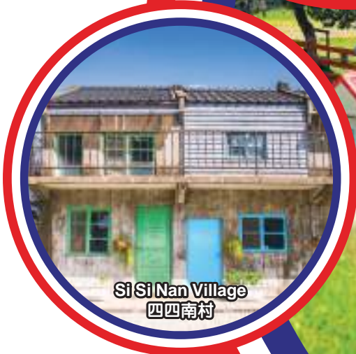
Si Si Nan Village 四四南村