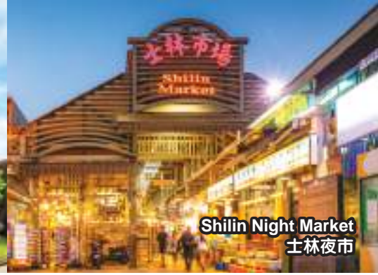
Shilin Night Market 士林夜市