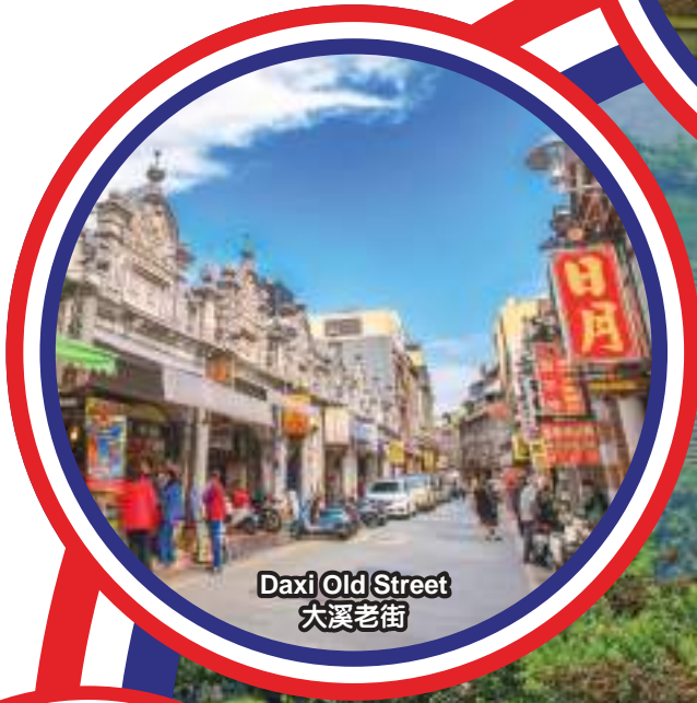
Daxi Old Street 大溪老街