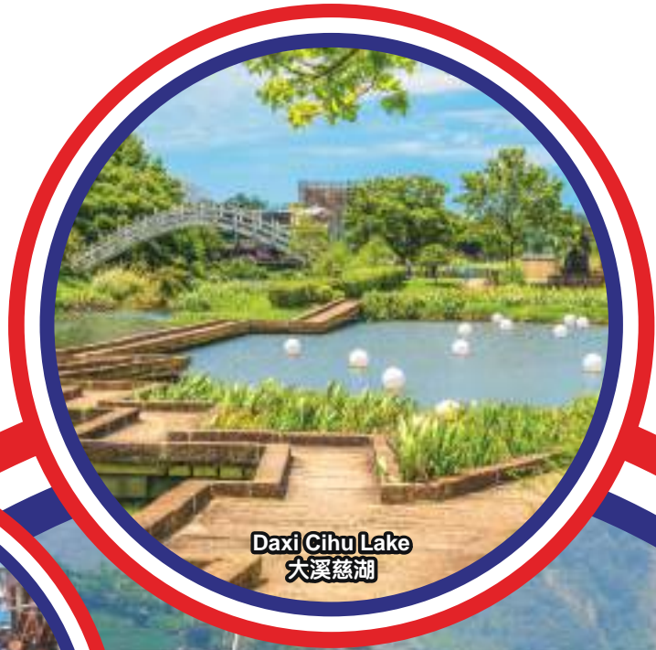
Daxi Cihu Lake 大溪慈湖