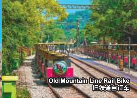
Old Mountain Line Rail Bike 旧铁道自行车