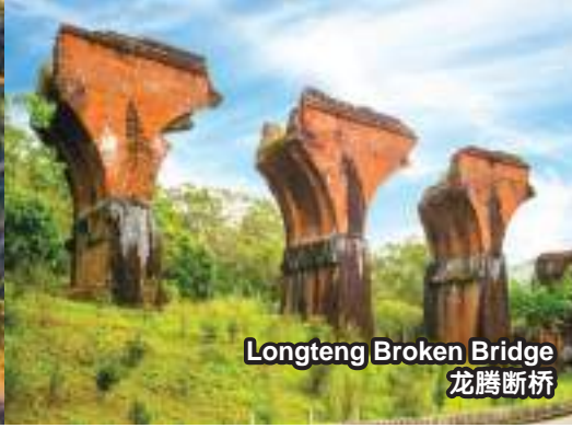
Longteng Broken Bridge 龙腾断桥