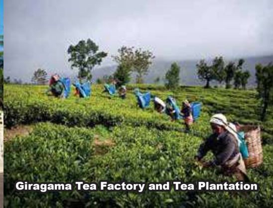
Giragama Tea Factory and Tea Plantation