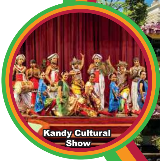
Kandy Cultural Show