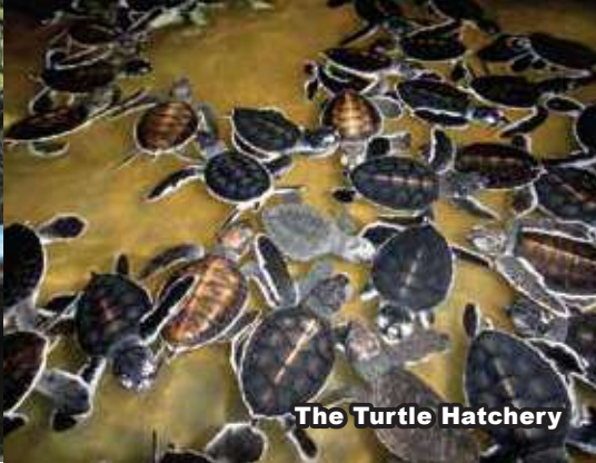
The Turtle Hatchery