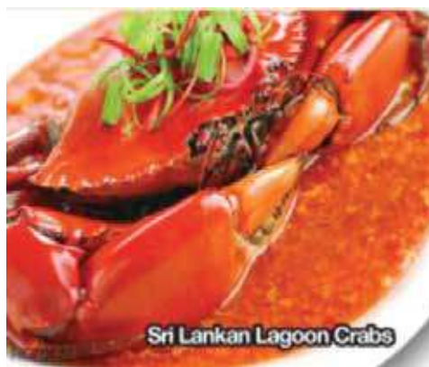
Sri Lankan Lagoon Crabs

Independence Memorial Hall – is a national monument in Sri Lanka built for commemoration of the independence of Sri Lanka from the British rule with the restoration of full governing responsibility to a Ceylonese – elected legislature on February 4, 1948.