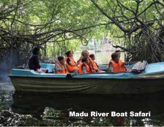
Madu River Boat Safari