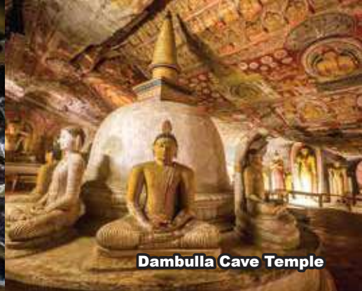
Dambulla Cave Temple