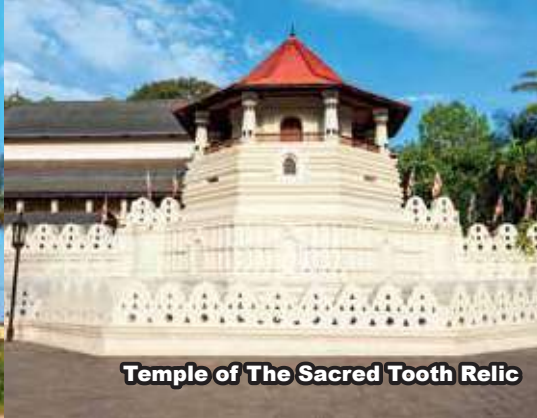
Temple of The Sacred Tooth Relic