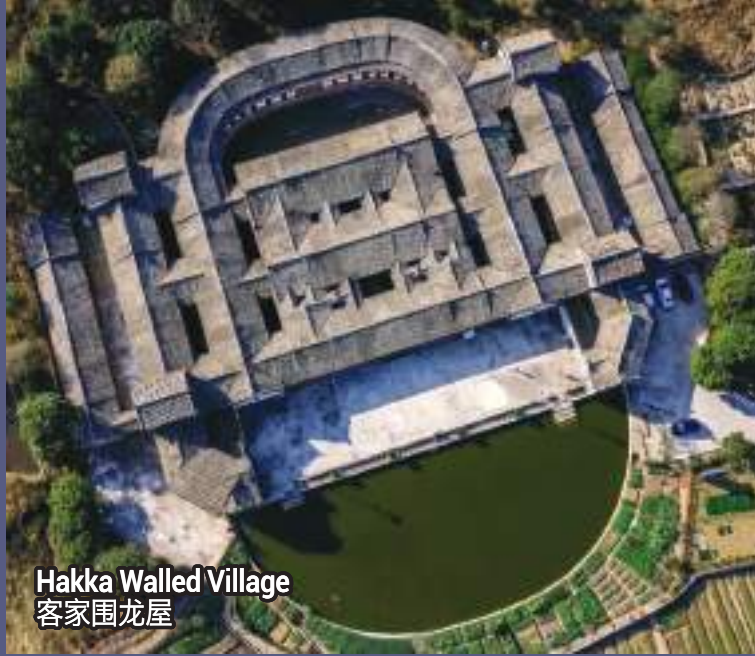
Hakka Walled Village 客家围龙屋