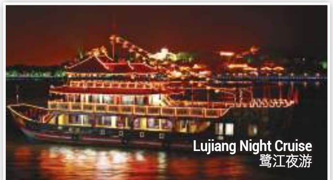
Lujiang Night Cruise 鹭江夜游