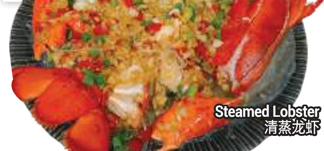
Steamed Lobster 清蒸龙虾