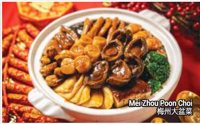
Mei Zhou Poon Choi 梅州大盆菜