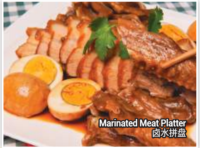
Marinated Meat Platter 卤水拼盘