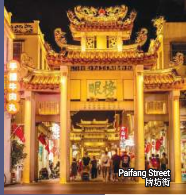
Paifang Street 牌坊街