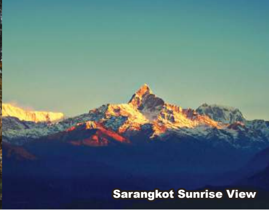
Sarangkot Sunrise View