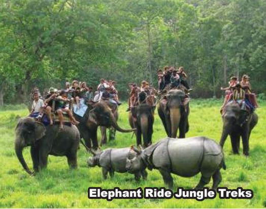
Elephant Ride Jungle Treks