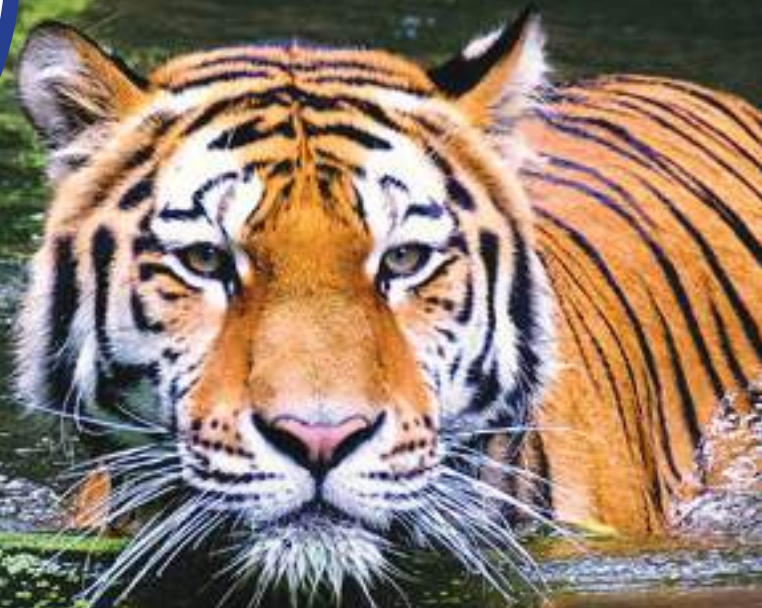
Chitwan National Park