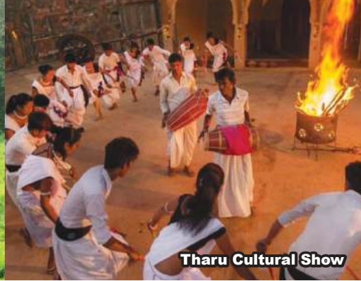
Tharu Cultural Show