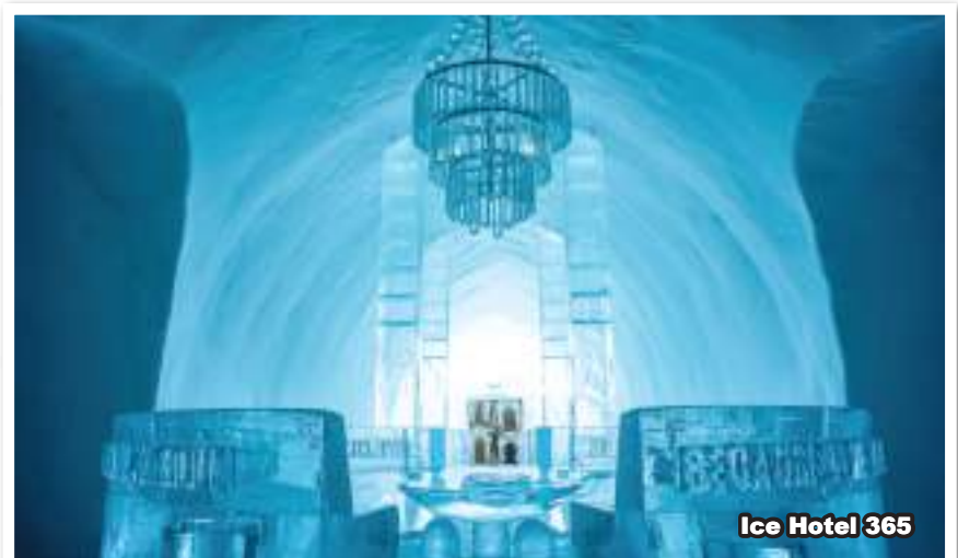
Ice Hotel 365