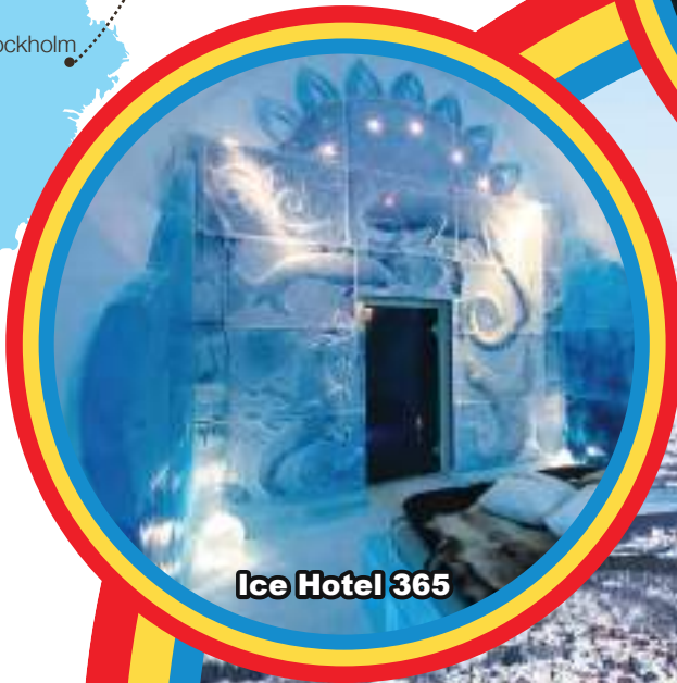
Ice Hotel 365