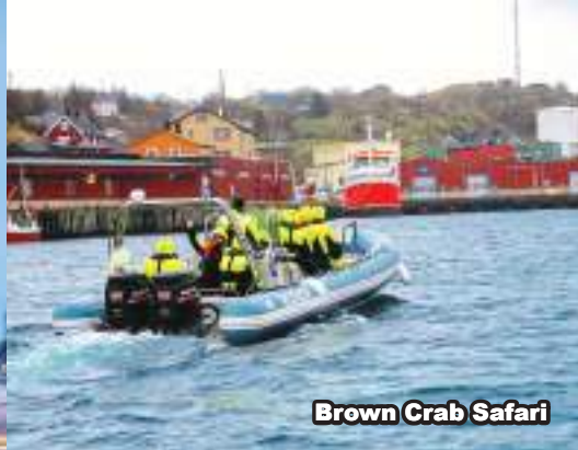
Brown Crab Safari