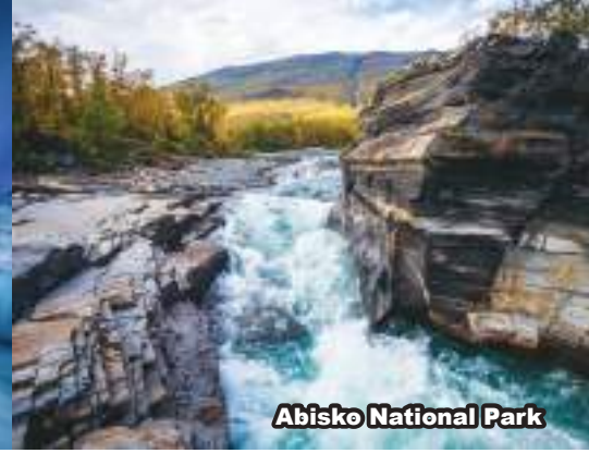
Abisko National Park