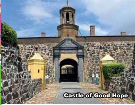
Castle of Good Hope