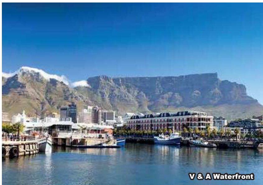
V & A Waterfront

Victoria & Alfred (V&A) Waterfront - South Africa's oldest working harbour, which dates back to 1654, first jetty was built by famous Dutch colonist Jan van Riebeeck. The landmarks that make up the tourist attractions, including the Clock Tower, the Original Port Captain's Office, Aquarium, Big Wheel, etc.