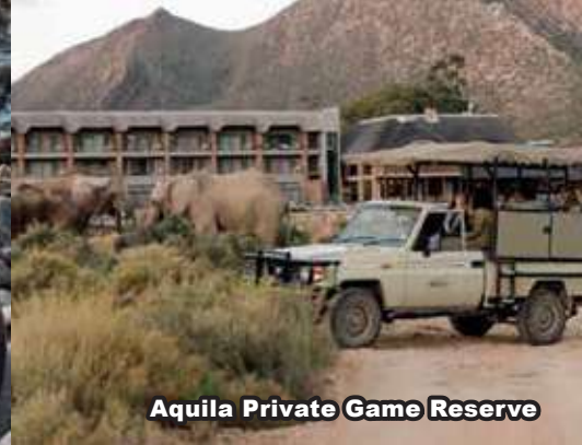
Aquila Private Game Reserve