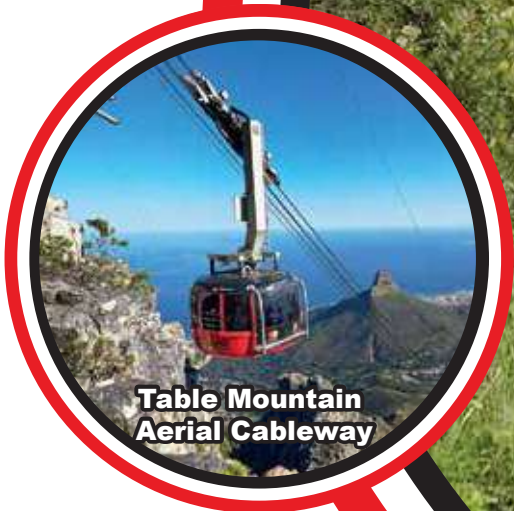
Table Mountain Aerial Cableway