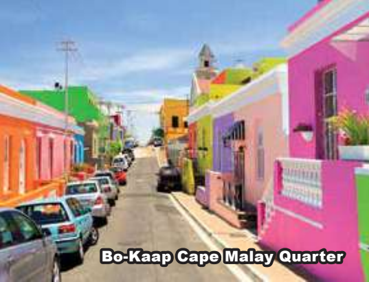
Bo-Kaap Cape Malay Quarter