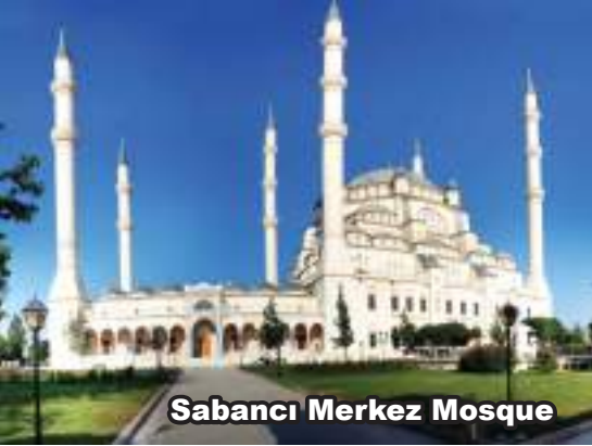
Sabancı Merkez Mosque