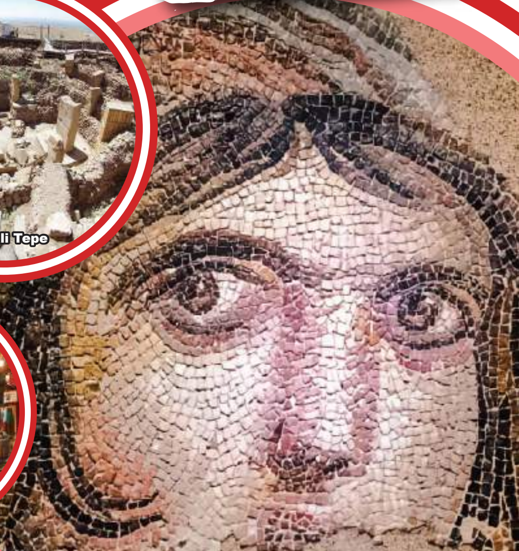
Zeugma Mosaic Museum