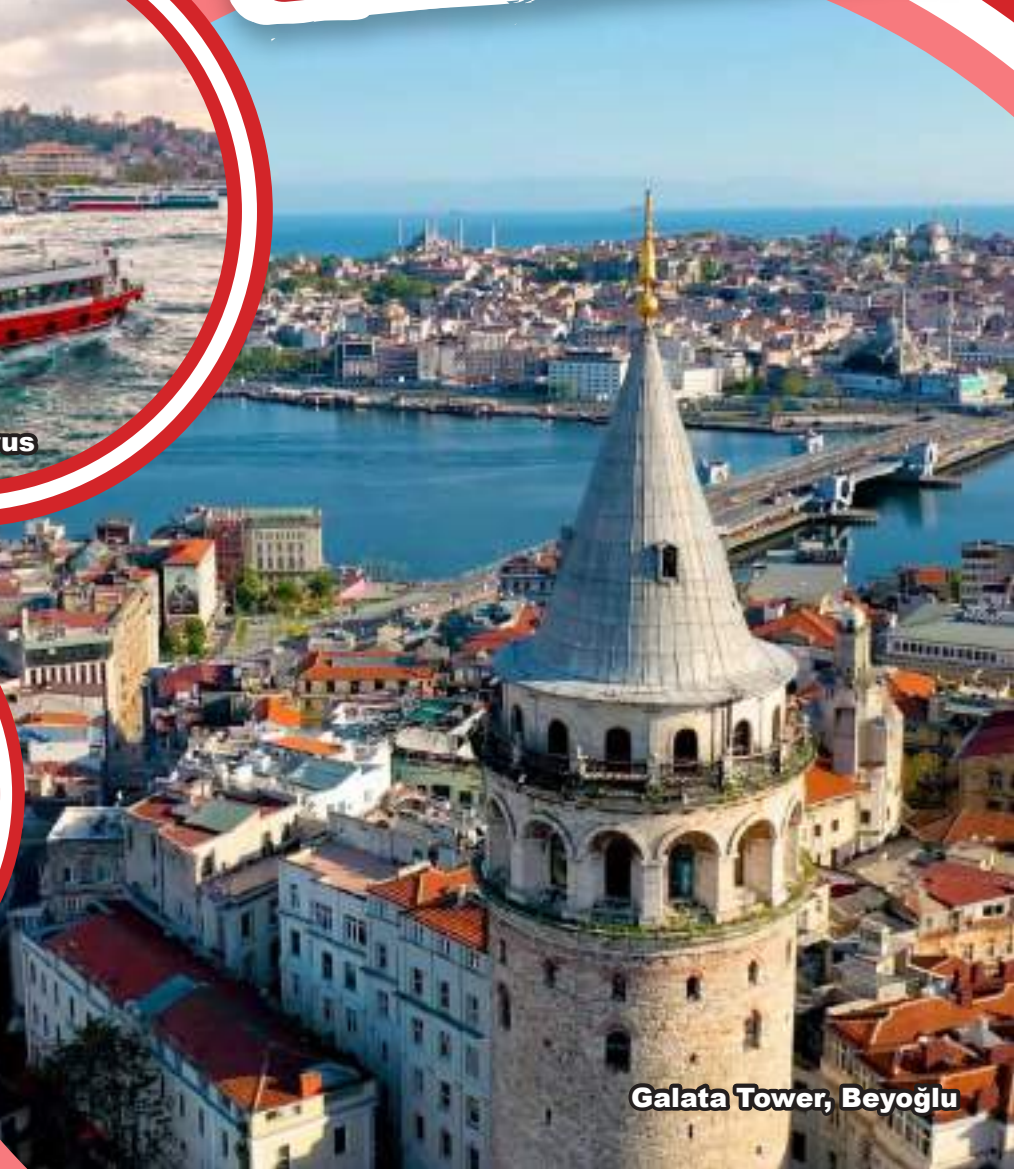
Galata Tower, Beyoğlu