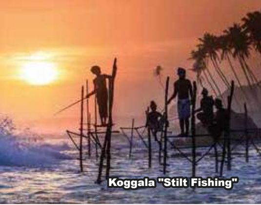
Koggala "Stilt Fishing"