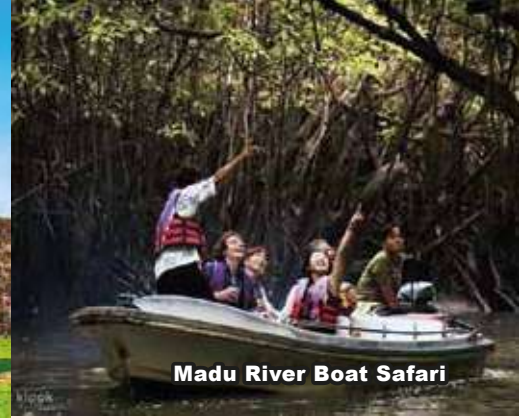
Madu River Boat Safari