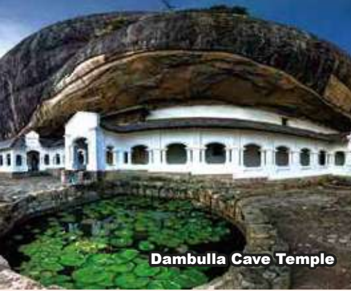
Dambulla Cave Temple