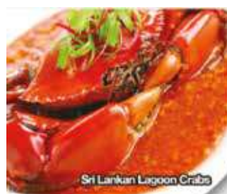
Sri Lankan Lagoon Crabs

Disclaimer: Due to Covid-19 travel restrictions, local / religious festivals, public holidays, weather condition, transport technical issue, acts of nature, Golden Destinations reserved the right to alter the sequence or change, amend or alter the itinerary if necessary, with or without prior notice.