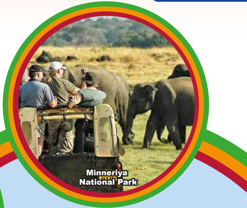
Minneriya National Park