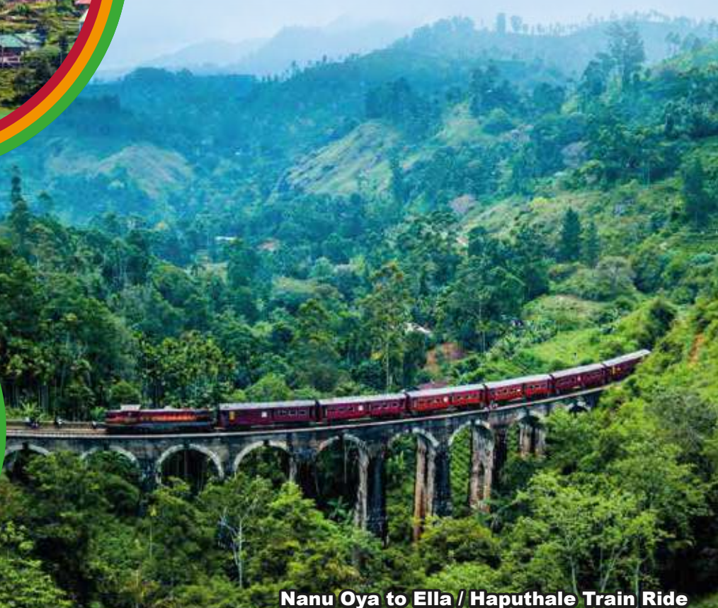
Nanu Oya to Ella / Haputhale Train Ride