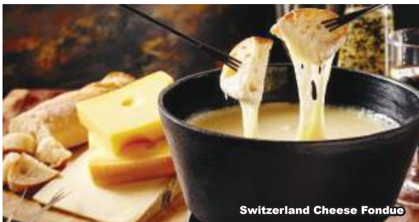
Switzerland Cheese Fondue

Disclaimer: Due to Covid-19 travel restrictions, local / religious festivals, public holidays, weather condition, transport technical issue, acts of nature, Golden Destinations reserved the right to alter the sequence or change, amend or alter the itinerary if necessary, with or without prior notice.