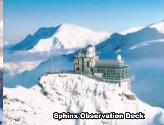
Sphinx Observation Deck