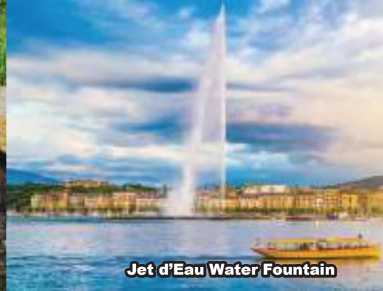
Jet d'Eau Water Fountain