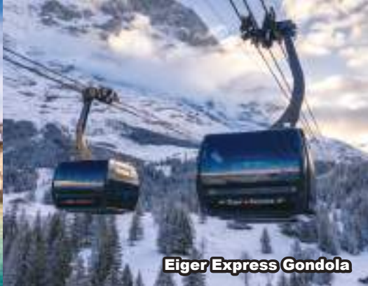
Eiger Express Gondola