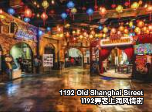
1192 Old Shanghai Street 1192弄老上海风情街