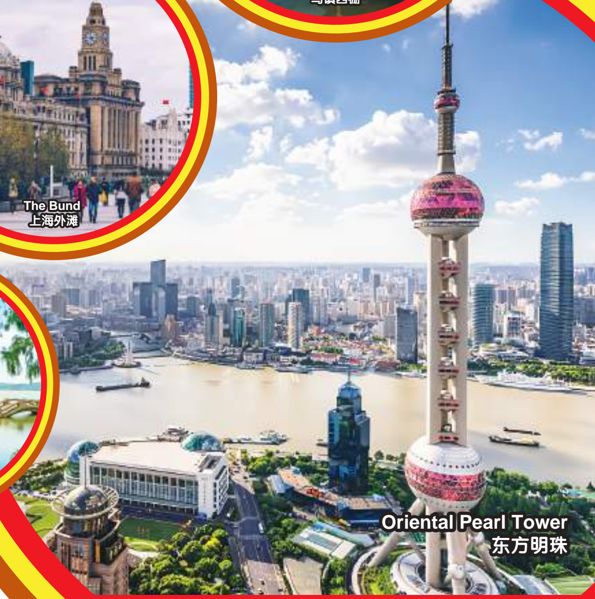
Oriental Pearl Tower 东方明珠

行程次序，以当地旅社安排为准。 Sequences of Itinerary are subject to local arrangement.