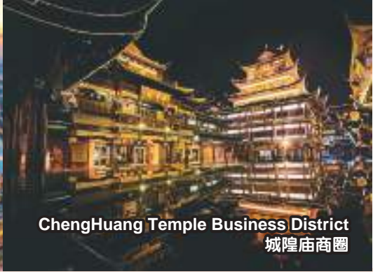
ChengHuang Temple Business District 城隍庙商圈