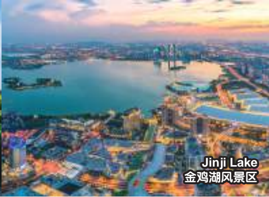
Jinji Lake 金鸡湖风景区