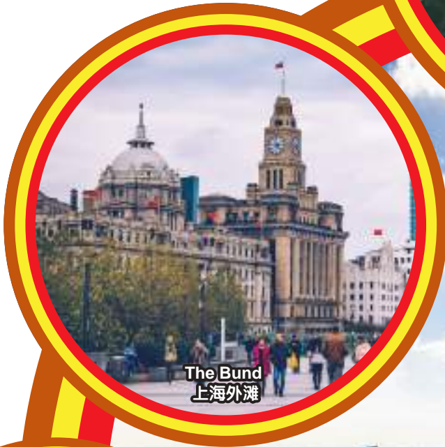
The Bund 上海外滩