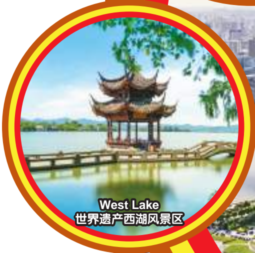
West Lake 世界遗产西湖风景区

行程次序，以当地旅社安排为准。 Sequences of Itinerary are subject to local arrangement.