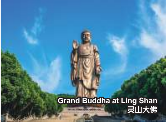
Grand Buddha at Ling Shan 灵山大佛