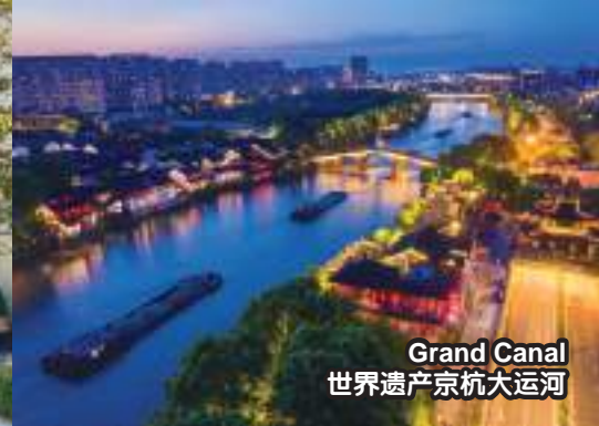
Grand Canal 世界遗产京杭大运河