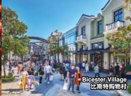
Bicester Village 比斯特购物村