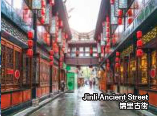
Jinli Ancient Street 锦里古街