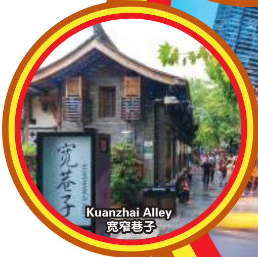
Kuanzhai Alley 宽窄巷子

行程次序，以当地旅社安排为准。 Sequences of Itinerary are subject to local arrangement.