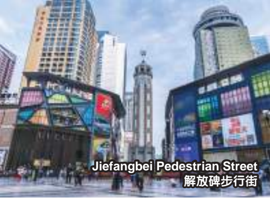
Jiefangbei Pedestrian Street 解放碑步行街