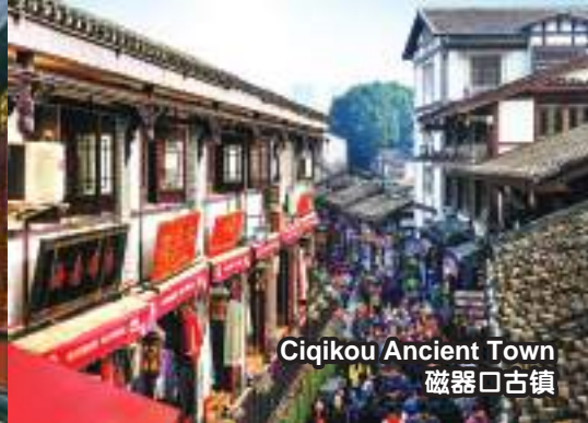
Ciqikou Ancient Town 磁器口古镇