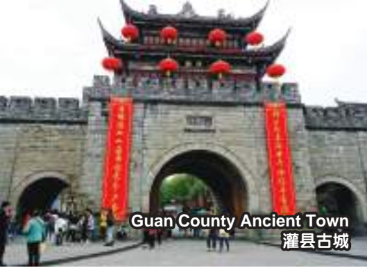
Guan County Ancient Town 灌县古城