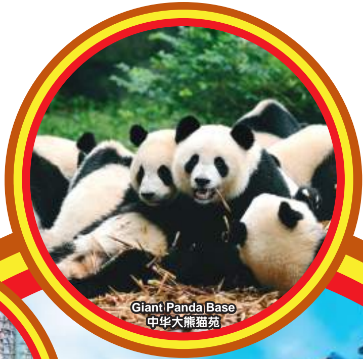
Giant Panda Base 中华大熊猫苑