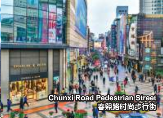
Chunxi Road Pedestrian Street 春熙路时尚步行街