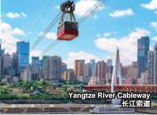
Yangtze River Cableway 长江索道