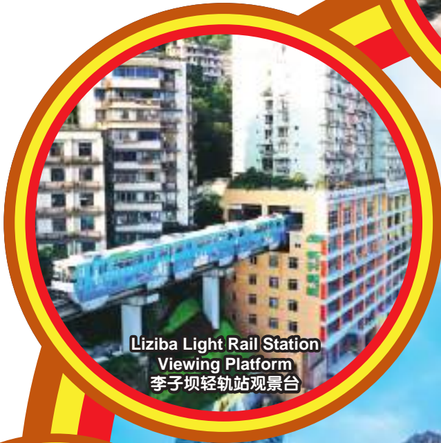
Liziba Light Rail Station Viewing Platform 李子坝轻轨站观景台