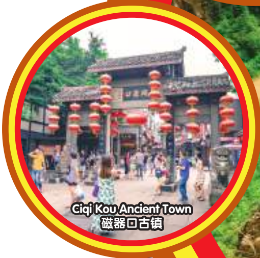
Ciqi Kou Ancient Town 磁器口古镇