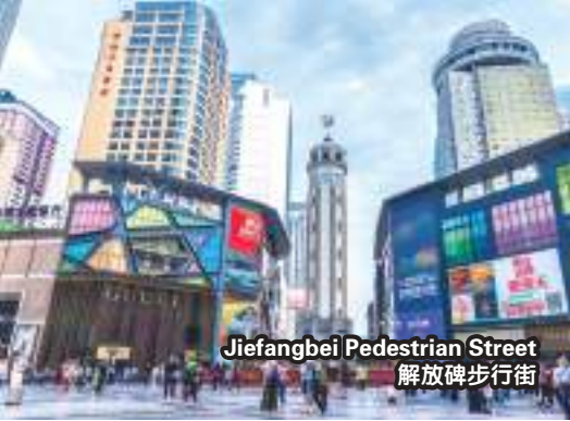
Jiefangbei Pedestrian Street 解放碑步行街