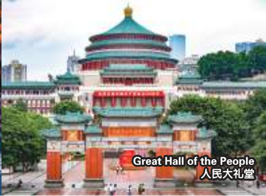
Great Hall of the People 人民大礼堂