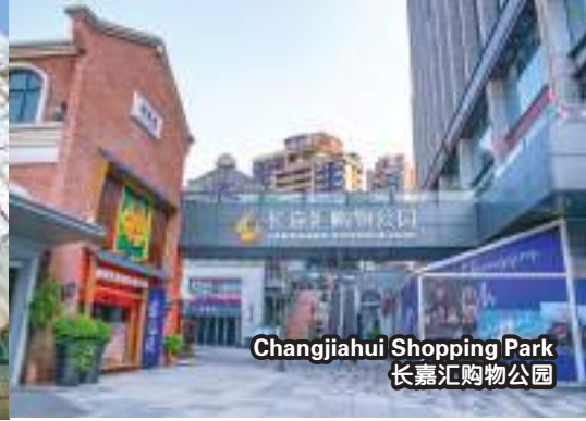
Changjiahui Shopping Park 长嘉汇购物公园