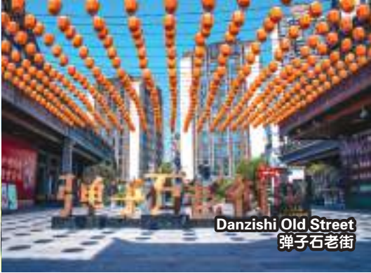
Danzishi Old Street 弹子石老街