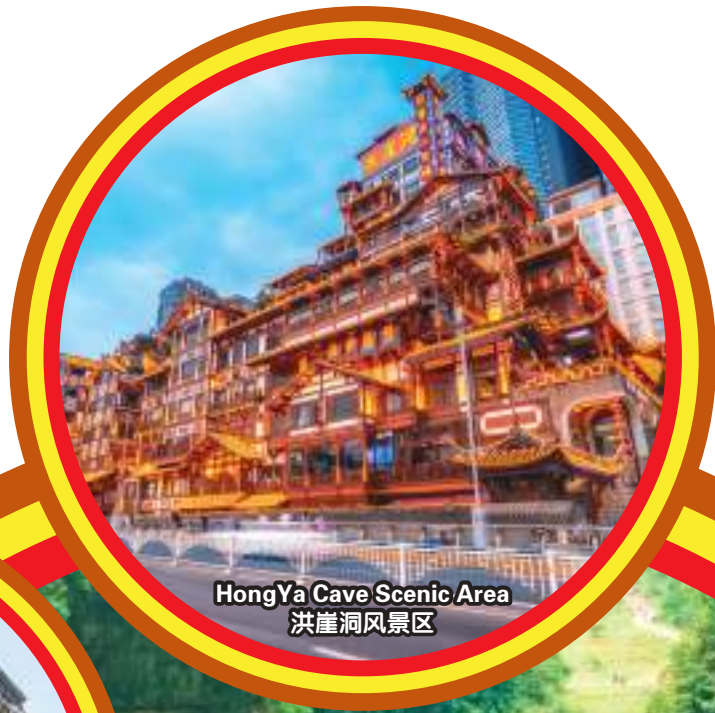
HongYa Cave Scenic Area 洪崖洞风景区