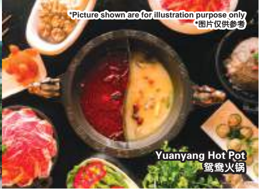
Yuanyang Hot Pot 鸳鸯火锅

*Picture shown are for illustration purpose only *图片仅供参考