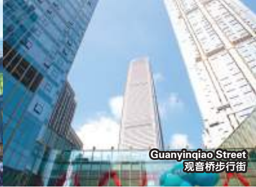
Guanyinqiao Street 观音桥步行街