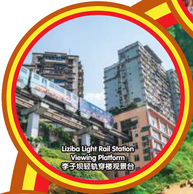
Liziba Light Rail Station Viewing Platform 李子坝轻轨穿楼观景台