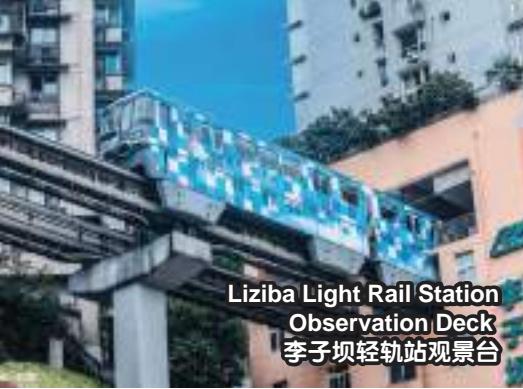
Liziba Light Rail Station Observation Deck 李子坝轻轨站观景台