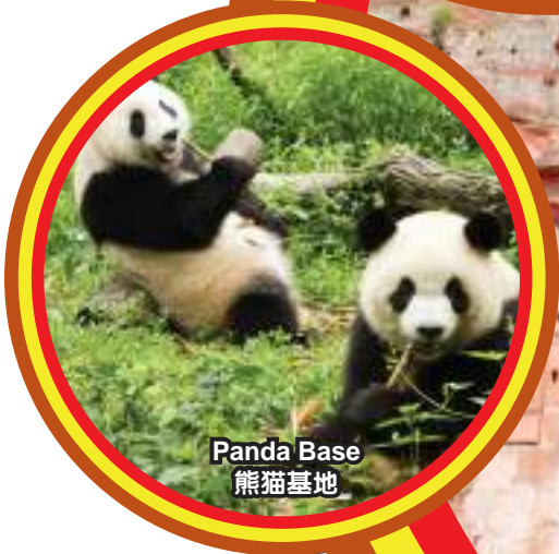
Panda Base 熊猫基地