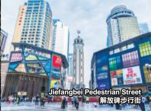
Jiefangbei Pedestrian Street 解放碑步行街