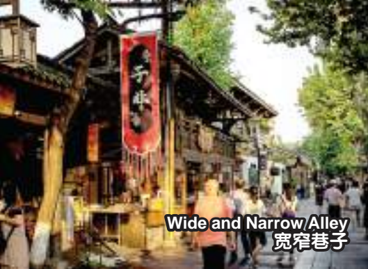
Wide and Narrow Alley 宽窄巷子