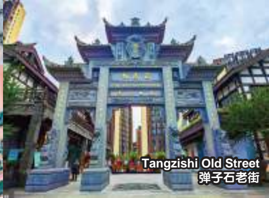
Tangzishi Old Street 弹子石老街