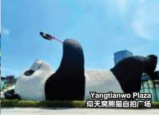
Yangtianwo Plaza 仰天窝熊猫自拍广场