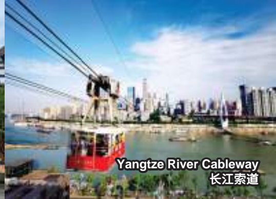
Yangtze River Cableway 长江索道