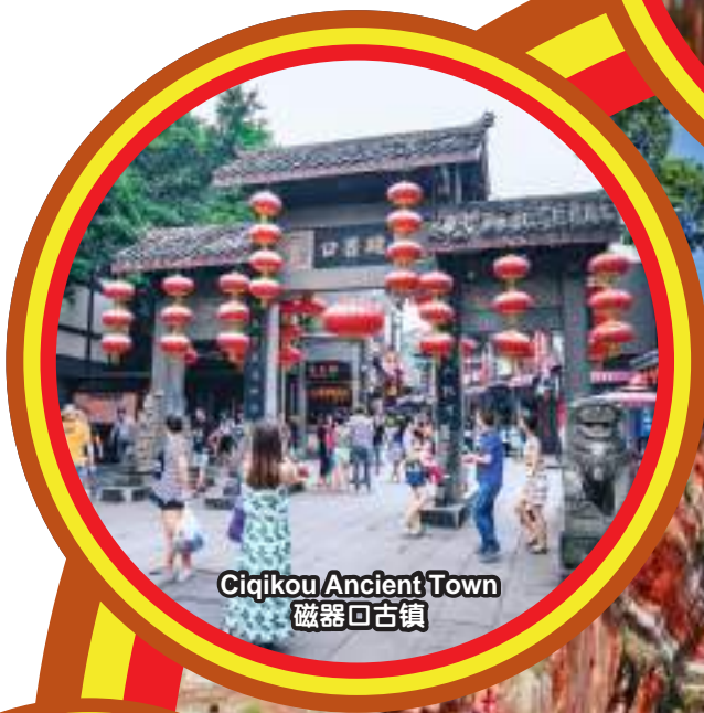
Ciqikou Ancient Town 磁器口古镇