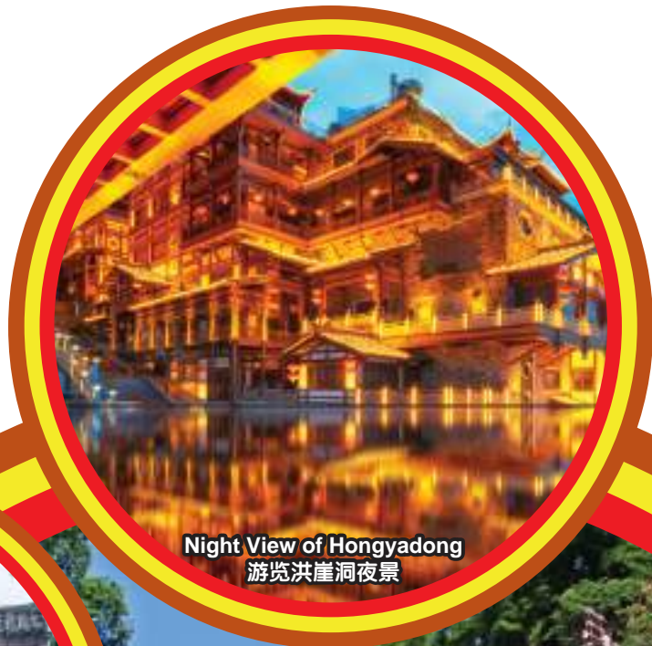
Night View of Hongyadong 游览洪崖洞夜景