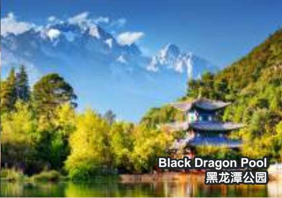
Black Dragon Pool 黑龙潭公园