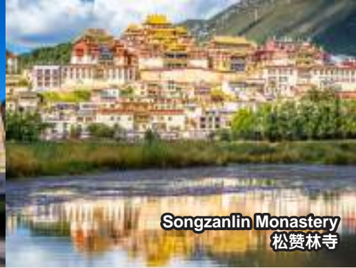
Songzanlin Monastery 松赞林寺