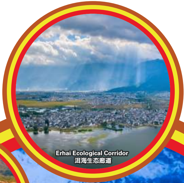
Erhai Ecological Corridor 洱海生态廊道