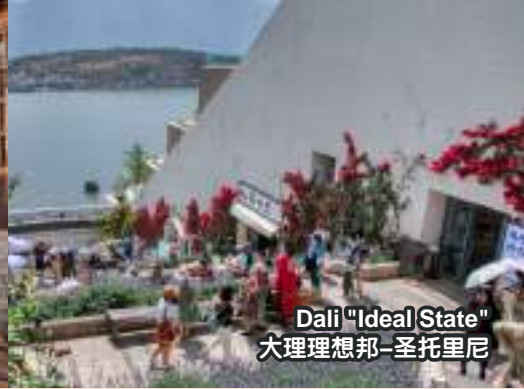
Dali "Ideal State" 大理理想邦-圣托里尼