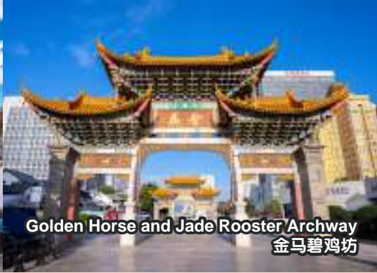
Golden Horse and Jade Rooster Archway 金马碧鸡坊