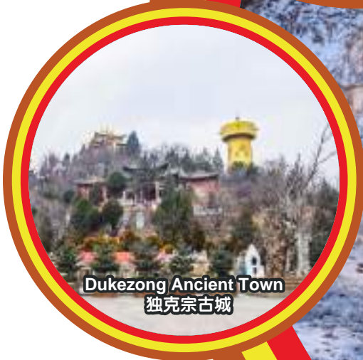
Dukezong Ancient Town 独克宗古城