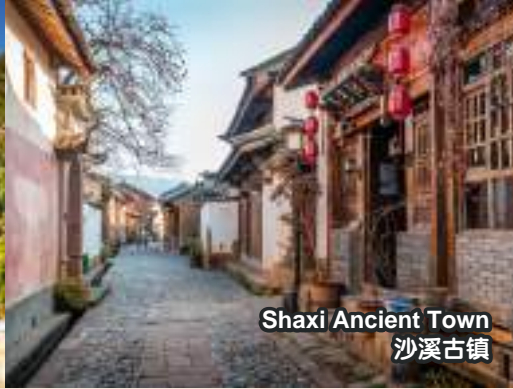
Shaxi Ancient Town 沙溪古镇