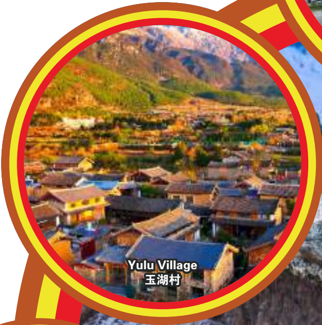
Yulu Village 玉湖村