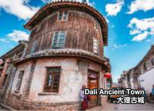
Dali Ancient Town 大理古城