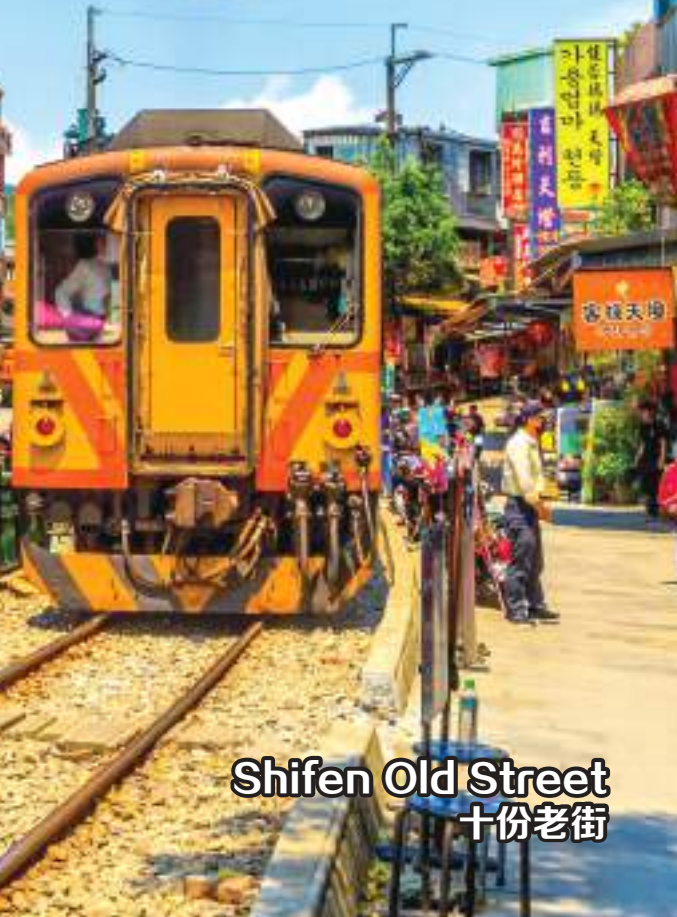
Shifen Old Street 十份老街

行程次序，以當地旅社安排為準。 Sequences of Itinerary are subject to local arrangement.