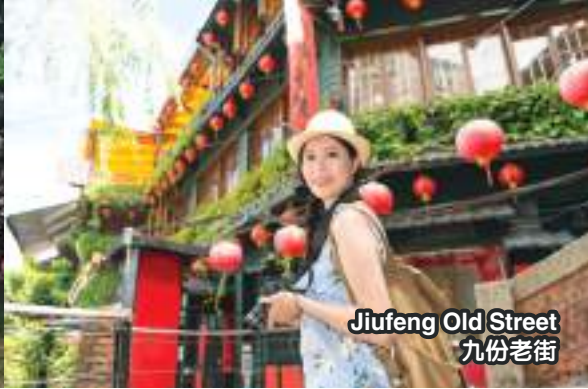
Jiufeng Old Street 九份老街