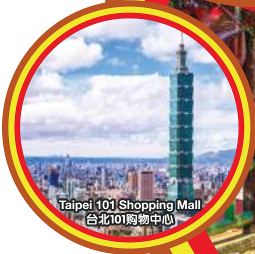
Taipei 101 Shopping Mall 台北101购物中心