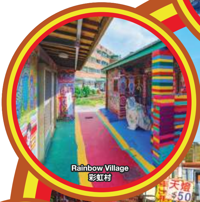
Rainbow Village 彩虹村