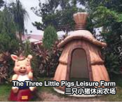
The Three Little Pigs Leisure Farm 三只小猪休闲农场