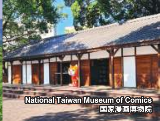
National Taiwan Museum of Comics 国家漫画博物院