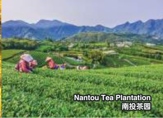
Nantou Tea Plantation 南投茶园