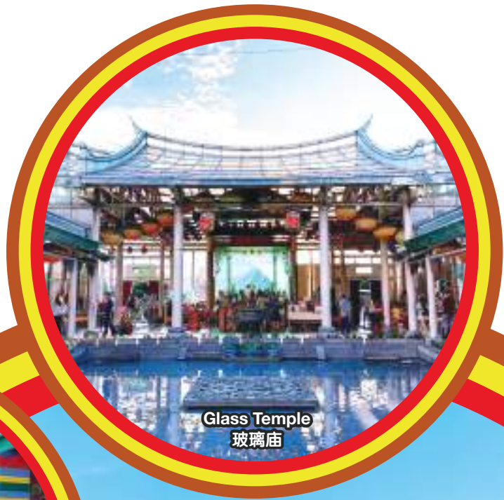
Glass Temple 玻璃庙