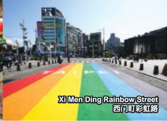
Xi Men Ding Rainbow Street 西门町彩虹路