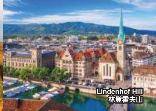
Lindenhof Hill 林登霍夫山