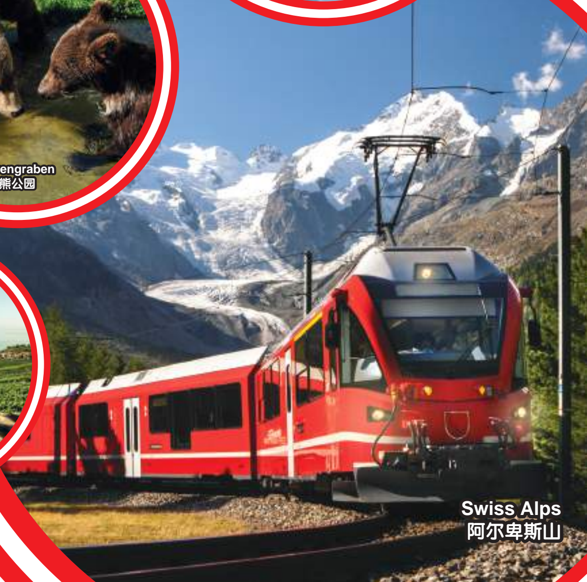
Swiss Alps 阿尔卑斯山

行程次序，以当地旅社安排为准。 Sequences of Itinerary are subject to local arrangement.