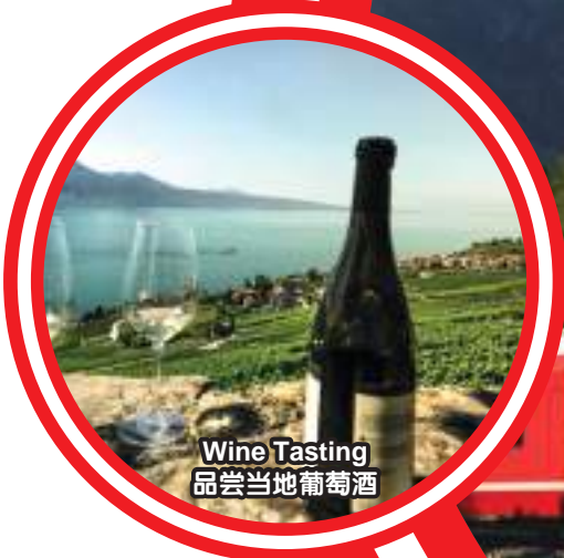
Wine Tasting 品尝当地葡萄酒