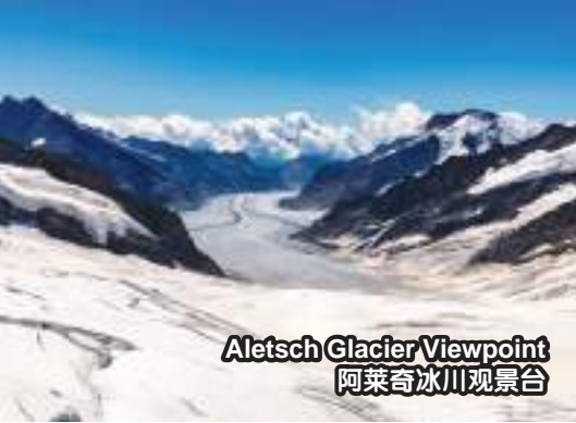
Alletsch Glacier Viewpoint 阿莱奇冰川观景台