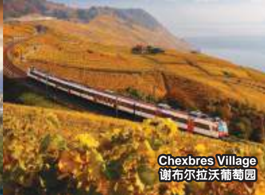
Chexbres Village 谢布尔拉沃葡萄酒园