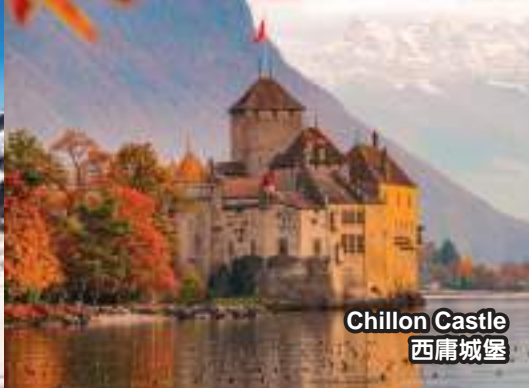
Chillon Castle 西庸城堡