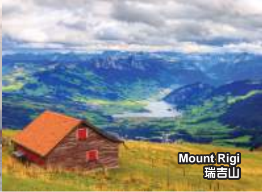
Mount Rigi 瑞吉山