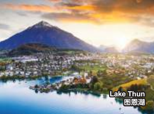
Lake Thun 图恩湖