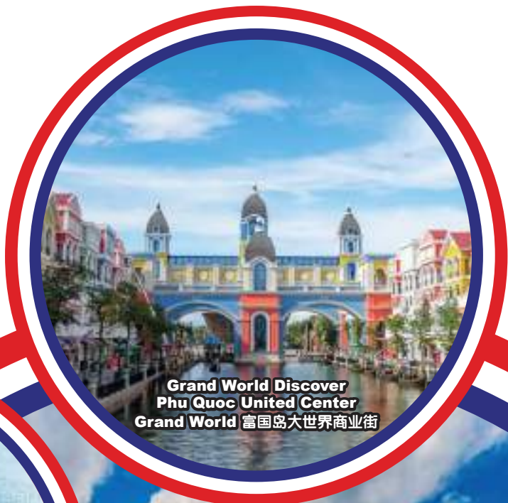
Grand World Discover Phu Quoc United Center Grand World 富国岛大世界商业街