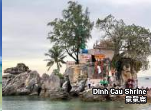
Dinh Cau Shrine 舅舅庙