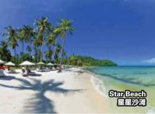
Star Beach 星星沙滩