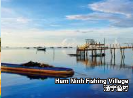
Ham Ninh Fishing Village 涵宁渔村