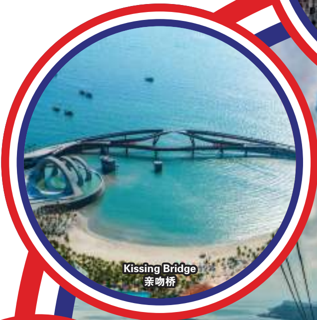
Kissing Bridge 亲吻桥