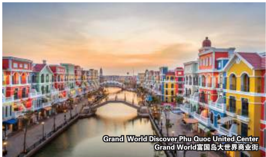
Grand World Discover Phu Quoc United Center Grand World富国岛大世界商业街

✓ Wyndham Garden Grandworld or similar class x3 Nights