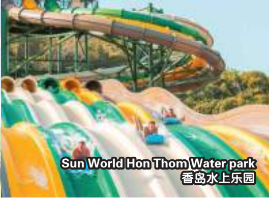
Sun World Hon Thom Water park 香岛水上乐园