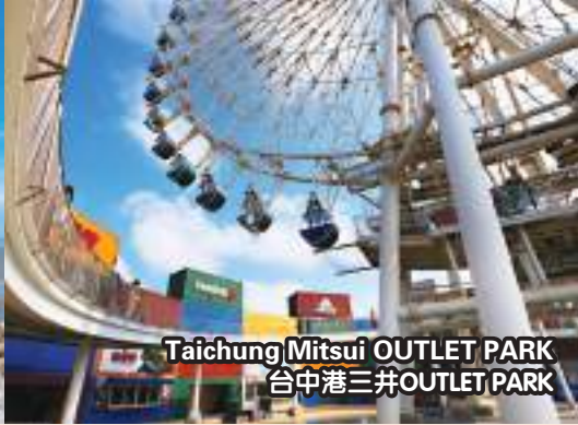
Taichung Mitsui OUTLET PARK 台中港三井OUTLET PARK