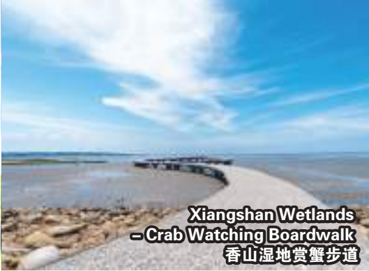
Xiangshan Wetlands - Crab Watching Boardwalk 香山湿地赏蟹步道