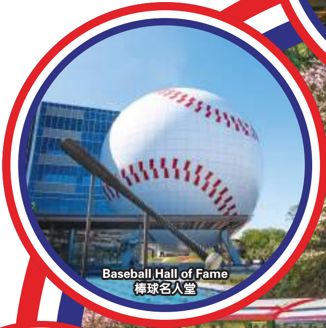
Baseball Hall of Fame 棒球名人堂