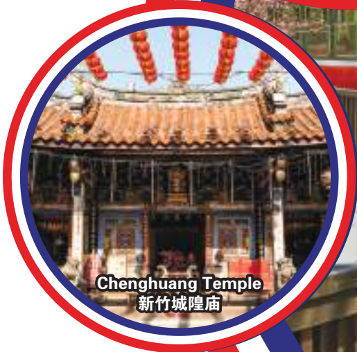
Chenghuang Temple 新竹城隍庙

行程次序，以当地旅社安排为准。 Sequences of Itinerary are subject to local arrangement.