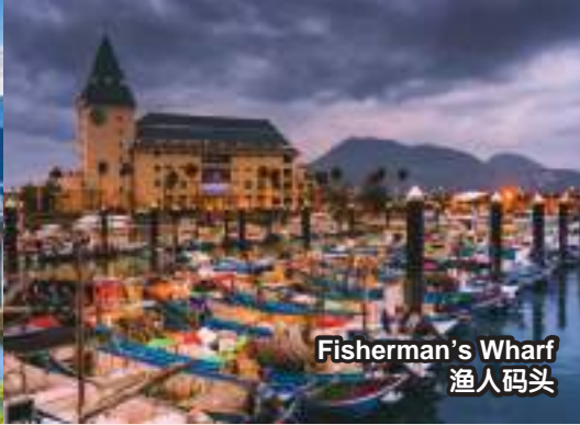
Fisherman's Wharf 渔人码头