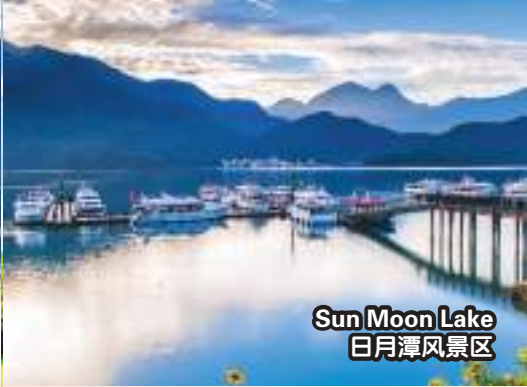
Sun Moon Lake 日月潭风景区