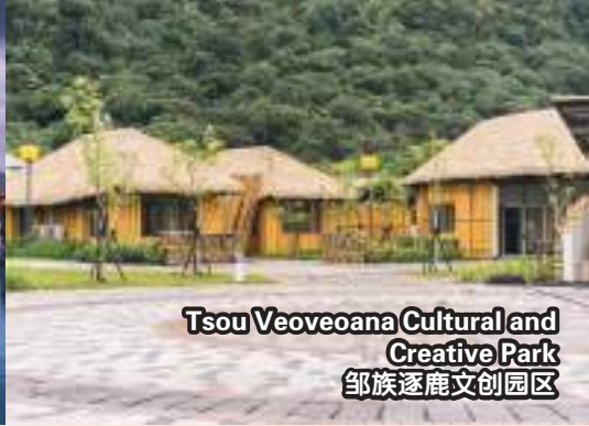
Tsou Veoveoana Cultural and Creative Park 邹族逐鹿文创园区