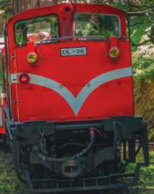
Alishan Forest Railway 阿里山搭乘小火车

行程次序，以当地旅社安排为准。 Sequences of Itinerary are subject to local arrangement.