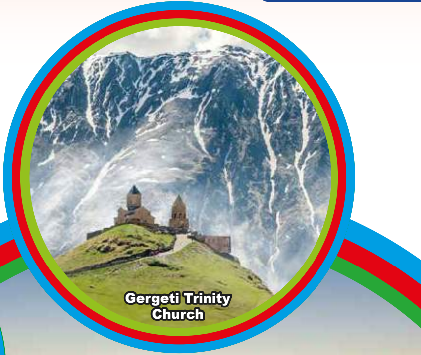
Gergeti Trinity Church