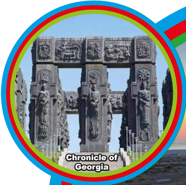
Chronicle of Georgia