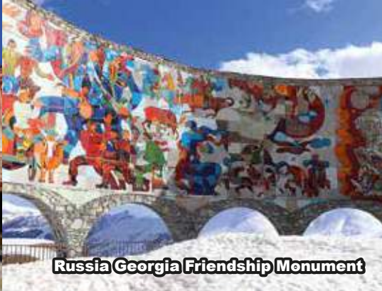
Russia Georgia Friendship Monument