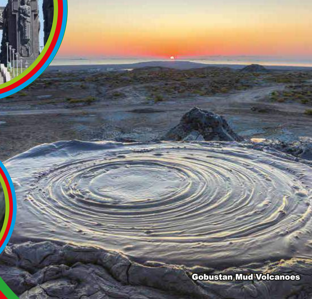
Gobustan Mud Volcanoes