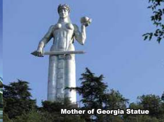
Mother of Georgia Statue