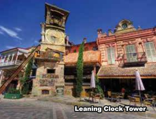
Leaning Clock Tower