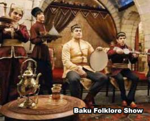
Baku Folklore Show