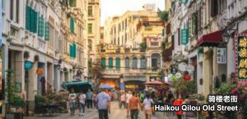
骑楼老街 Haikou Qilou Old Street