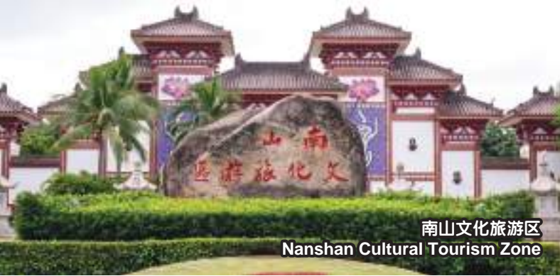
南山文化旅游区 Nanshan Cultural Tourism Zone