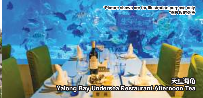
天涯海角 Yalong Bay Undersea Restaurant Afternoon Tea

*Picture shown are for illustration purpose only *图片仅供参考