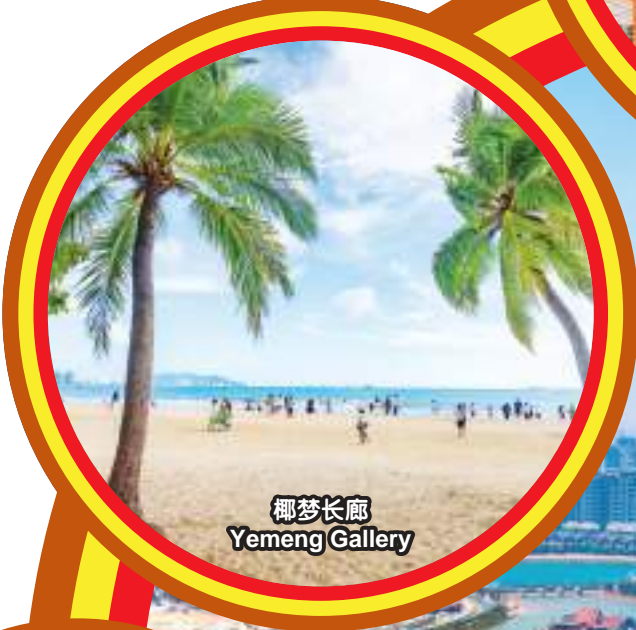
椰梦长廊 Yemeng Gallery