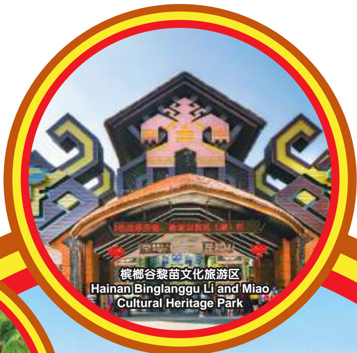
槟榔谷黎苗文化旅游区 Hainan Binglanggu Li and Miao Cultural Heritage Park