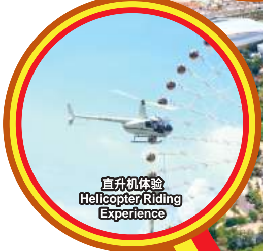
直升机体验 Helicopter Riding Experience

行程次序，以当地旅社安排为准。 Sequences of Itinerary are subject to local arrangement.