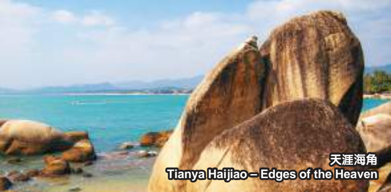
天涯海角 Tianya Haijiao - Edges of the Heaven