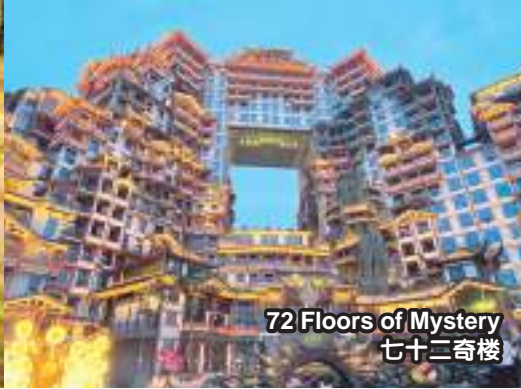
72 Floors of Mystery 七十二奇楼