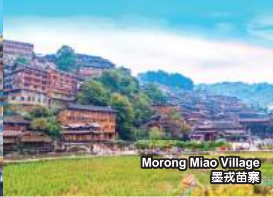
Morong Miao Village 墨戎苗寨