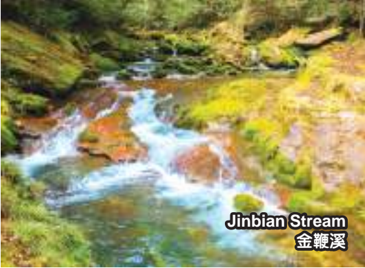
Jinbian Stream 金鞭溪