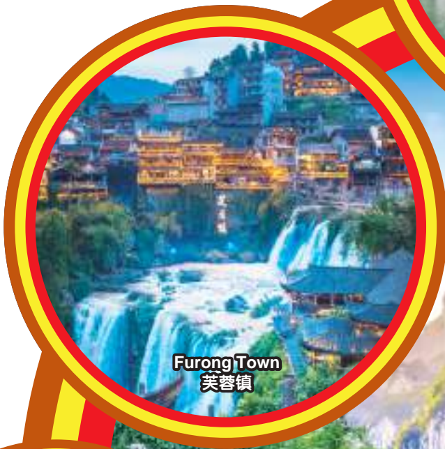
Furong Town 芙蓉镇