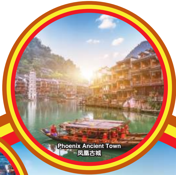
Phoenix Ancient Town 凤凰古城