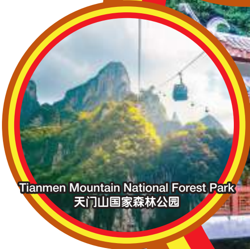
Tianmen Mountain National Forest Park 天门山国家森林公园