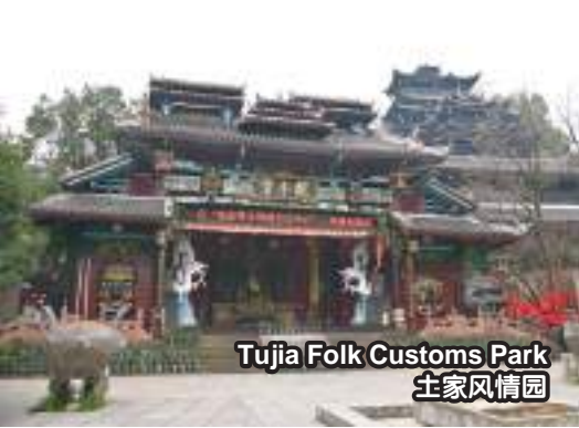
Tujia Folk Customs Park 土家风情园