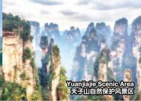
Yuanjiajie Scenic Area 天子山自然保护风景区