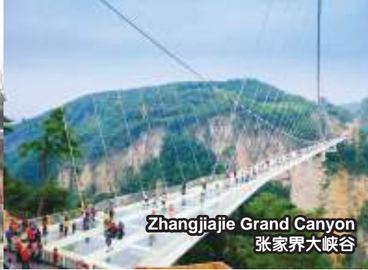
Zhangjiajie Grand Canyon 张家界大峡谷