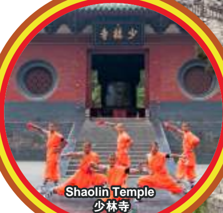
Shaolin Temple 少林寺