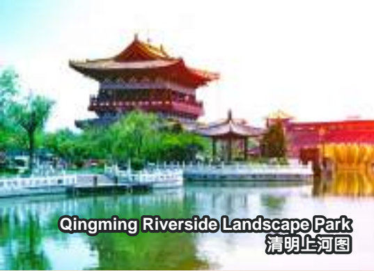
Qingming Riverside Landscape Park 清明上河图