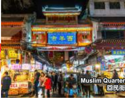
Muslim Quarter 回民街