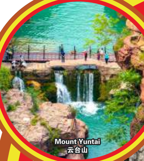
Mount Yuntai 云台山