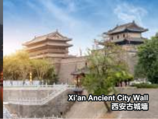
Xi'an Ancient City Wall 西安古城墙