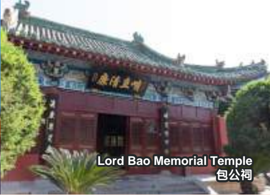
Lord Bao Memorial Temple 包公祠