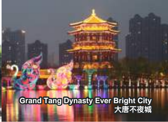
Grand Tang Dynasty Ever Bright City 大唐不夜城