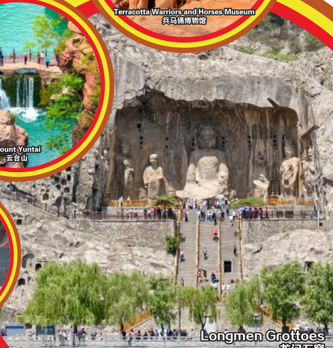
Longmen Grottoes 龙门石窟

行程次序, 以当地旅社安排为准。 Sequences of Itinerary are subject to local arrangement.