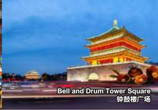
Bell and Drum Tower Square 钟鼓楼广场