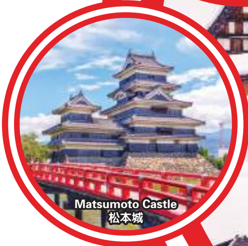
Matsumoto Castle 松本城

行程次序，以當地旅社安排為準。 Sequences of Itinerary are subject to local arrangement.