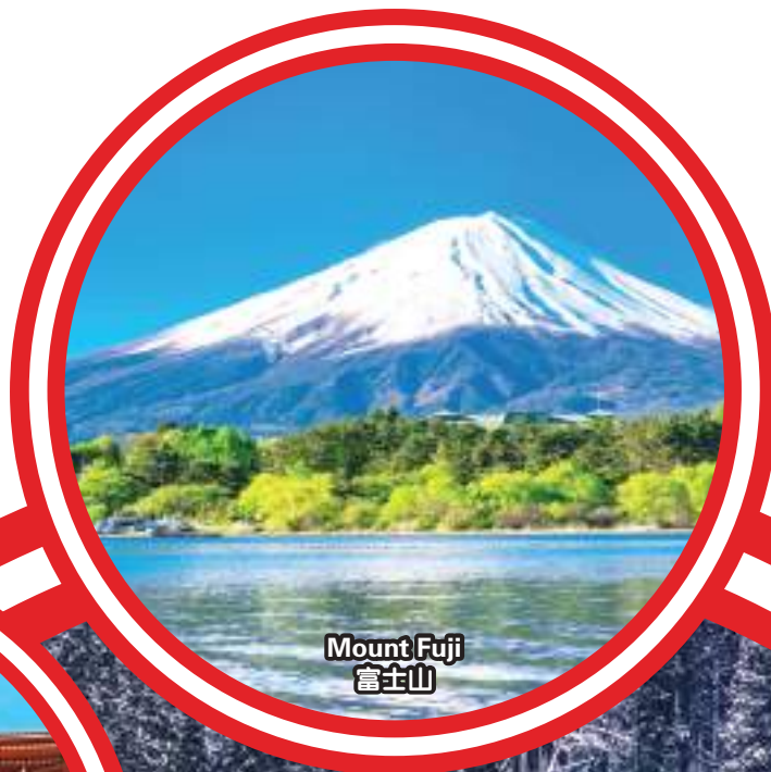
Mount Fuji 富士山