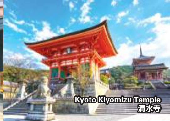
Kyoto Kiyomizu Temple 清水寺