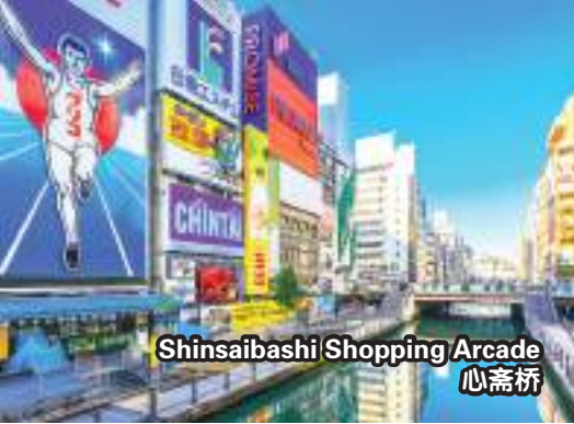
Shinsaibashi Shopping Arcade 心齋橋