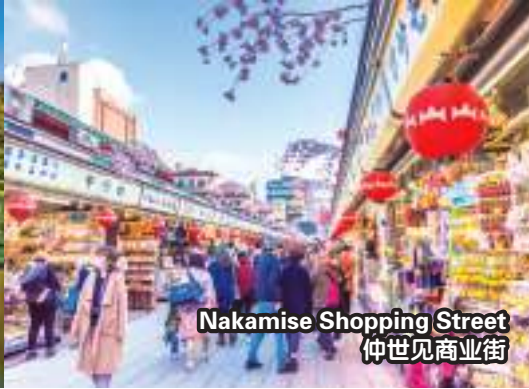
Nakamise Shopping Street 仲世见商业街