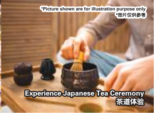
Experience Japanese Tea Ceremony 茶道体验