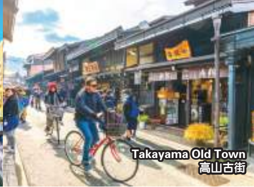
Takayama Old Town 高山古街