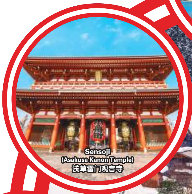
Sensoji (Asakusa Kanon Temple) 浅草雷门观音寺