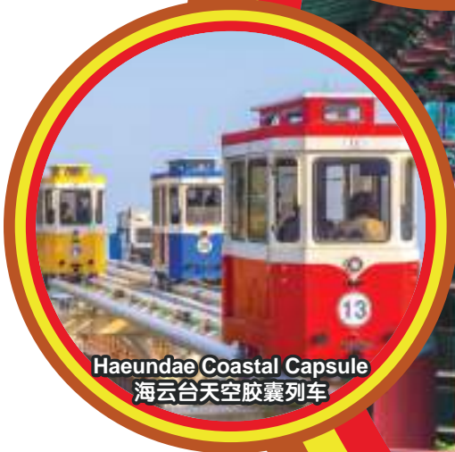
Haeundae Coastal Capsule 海云台天空胶囊列车