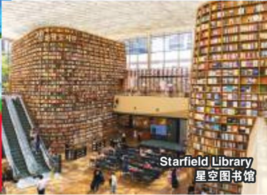
Starfield Library 星空图书馆