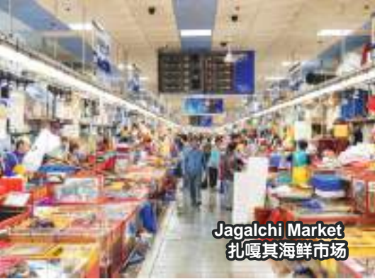
Jagalchi Market 扎嘎其海鲜市场