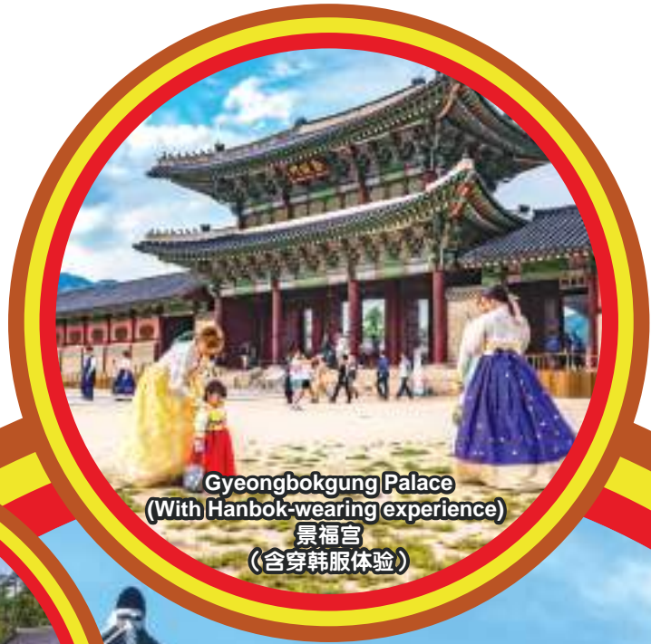
Gyeongbokgung Palace (With Hanbok-wearing experience) 景福宫 (含穿韩服体验)