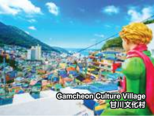
Gamcheon Culture Village 甘川文化村