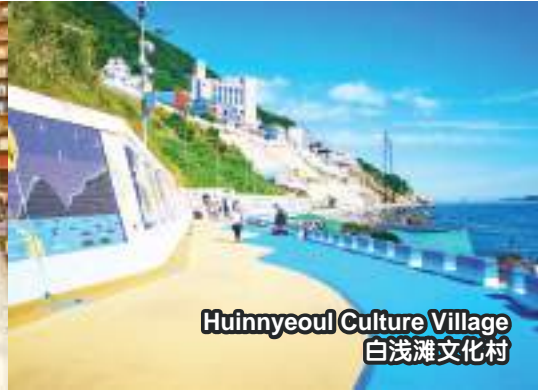
Huinnyeoul Culture Village 白浅滩文化村