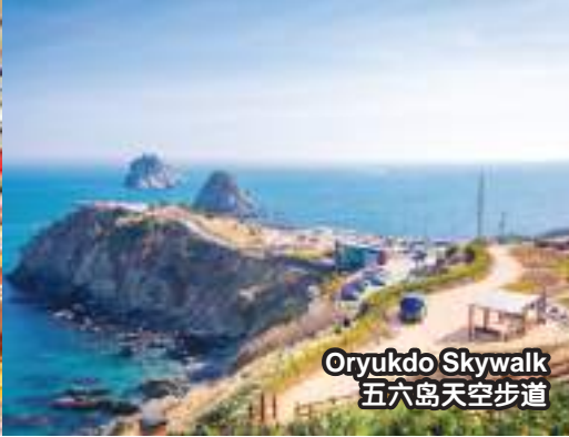
Oryukdo Skywalk 五六岛天空步道