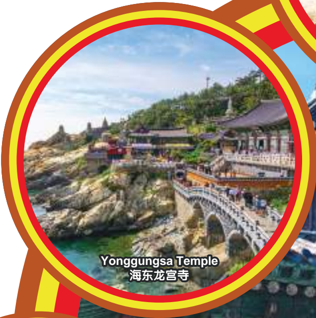
Yonggungsa Temple 海东龙宫寺