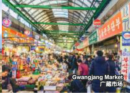
Gwangjang Market 广藏市场