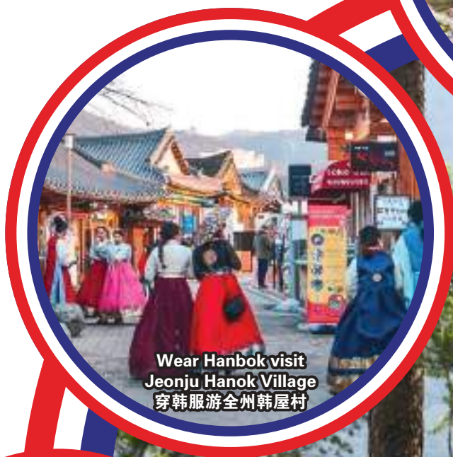
Wear Hanbok visit Jeonju Hanok Village 穿韩服游全州韩屋村