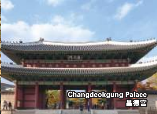
Changdeokgung Palace 昌德宫