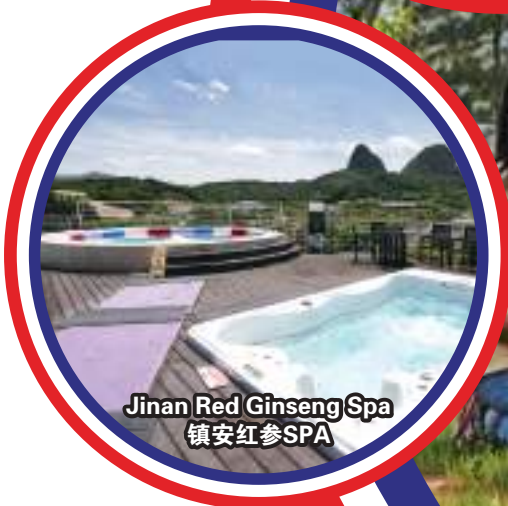
Jinan Red Ginseng Spa 镇安红参SPA

行程次序，以当地旅社安排为准。 Sequences of Itinerary are subject to local arrangement.