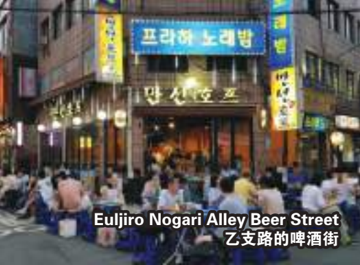
Euljiro Nogari Alley Beer Street 乙支路的啤酒街