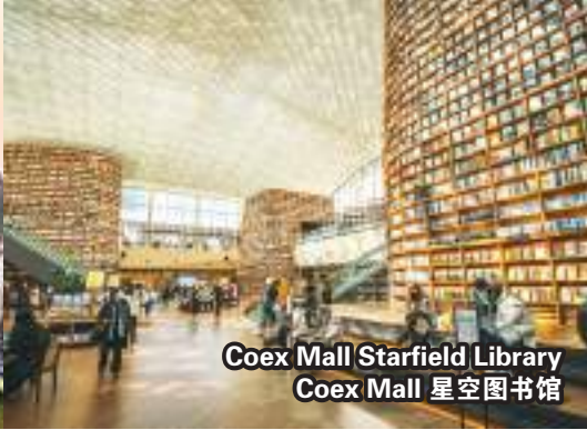
Coex Mall Starfield Library Coex Mall 星空图书馆