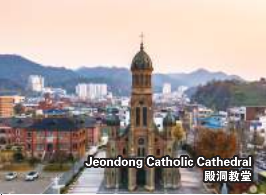
Jeondong Catholic Cathedral 殿洞教堂