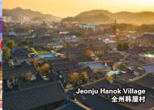
Jeonju Hanok Village 全州韩屋村