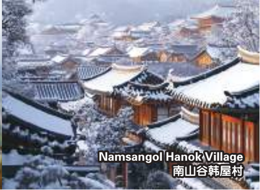
Namsangol Hanok Village 南山谷韩屋村