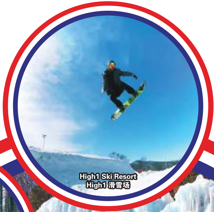
High1 Ski Resort High1 滑雪场