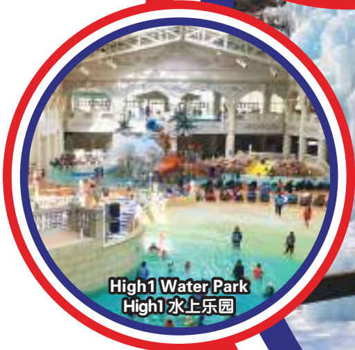
High1 Water Park High1 水上乐园