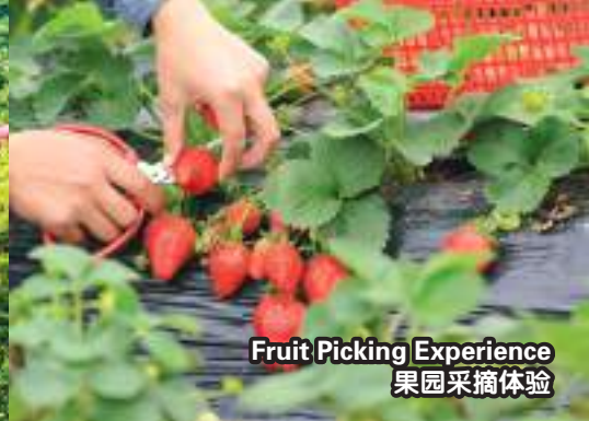
Fruit Picking Experience 果园采摘体验