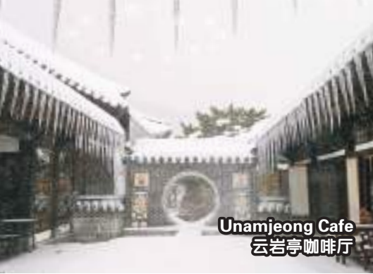
Unamjeong Cafe 云岩亭咖啡厅