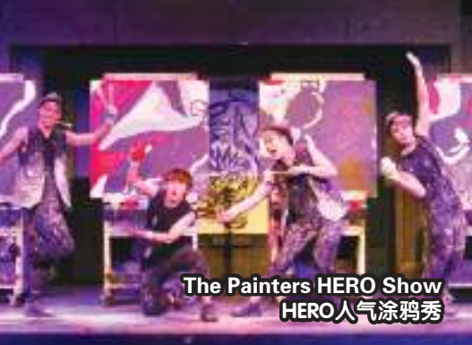
The Painters HERO Show HERO人气涂鸦秀