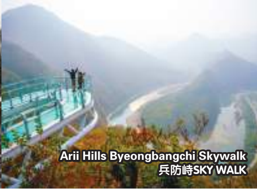
Arii Hills Byeongbangchi Skywalk 兵防峙SKY WALK