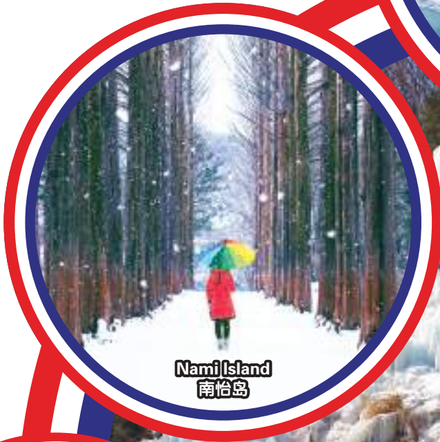
Nami Island 南怡岛