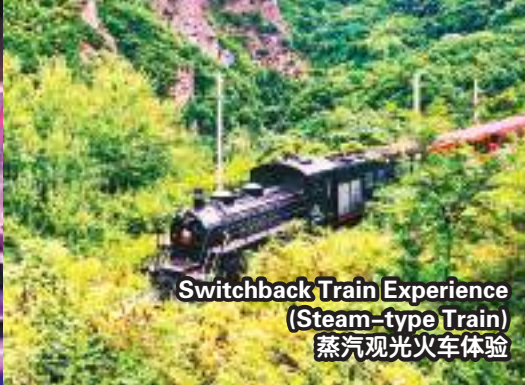
Switchback Train Experience (Steam-type Train) 蒸汽观光火车体验