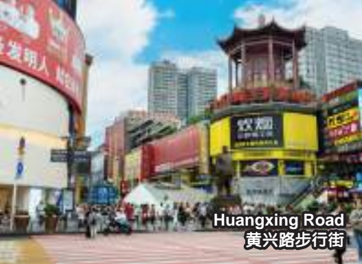
Huangxing Road 黄兴路步行街