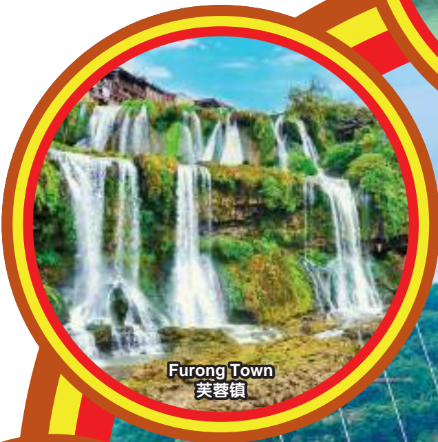
Furong Town 芙蓉镇