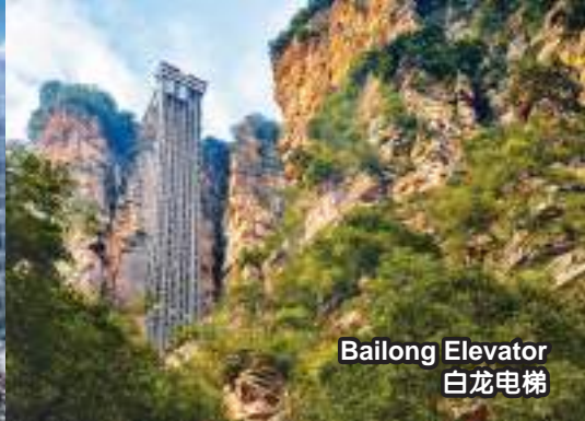
Bailong Elevator 白龙电梯