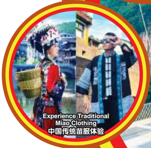
Experience Traditional Miao Clothing 中国传统苗服体验