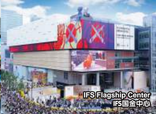
IFS Flagship Center IFS国金中心