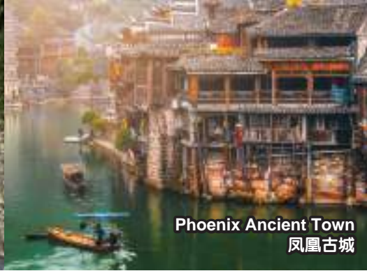
Phoenix Ancient Town 凤凰古城