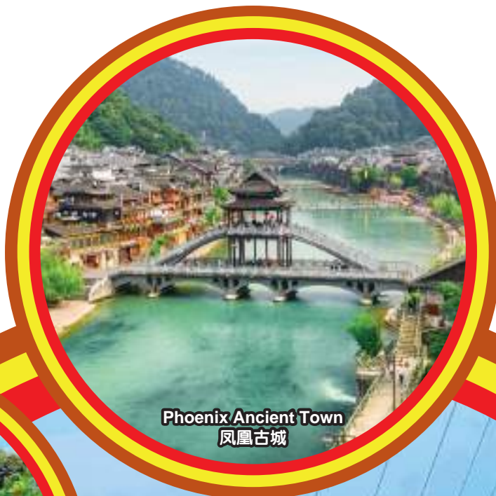
Phoenix Ancient Town 凤凰古城