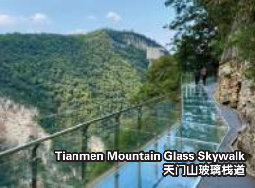
Tianmen Mountain Glass Skywalk 天门山玻璃栈道