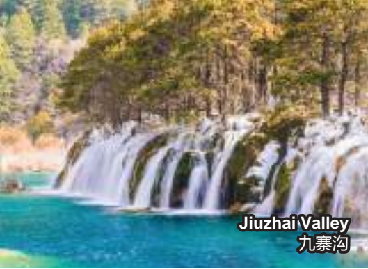
Jiuzhai Valley 九寨沟