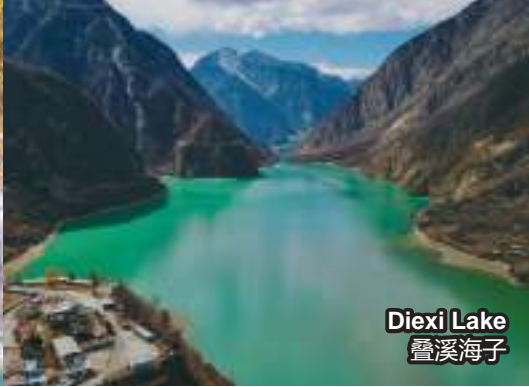
Diexi Lake 叠溪海子