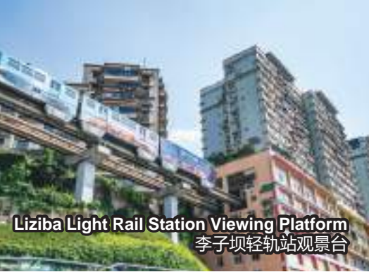
Liziba Light Rail Station Viewing Platform 李子坝轻轨站观景台