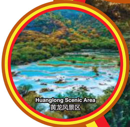
Huanglong Scenic Area 黄龙风景区