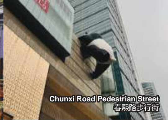
Chunxi Road Pedestrian Street 春熙路步行街