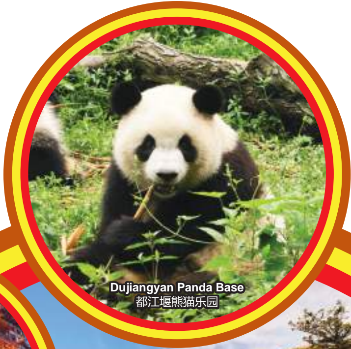
Dujiangyan Panda Base 都江堰熊猫乐园