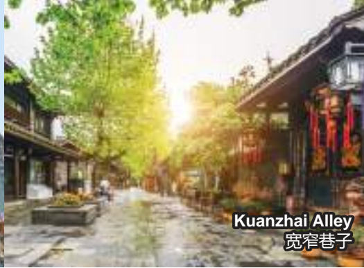
Kuanzhai Alley 宽窄巷子