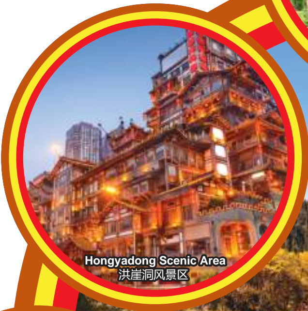
Hongyadong Scenic Area 洪崖洞风景区