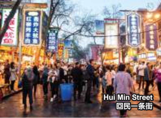
Hui Min Street 回民一条街