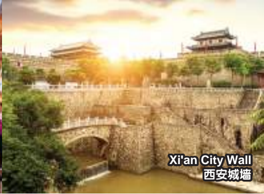
Xi'an City Wall 西安城墙