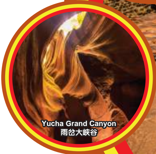
Yucha Grand Canyon 雨岔大峡谷