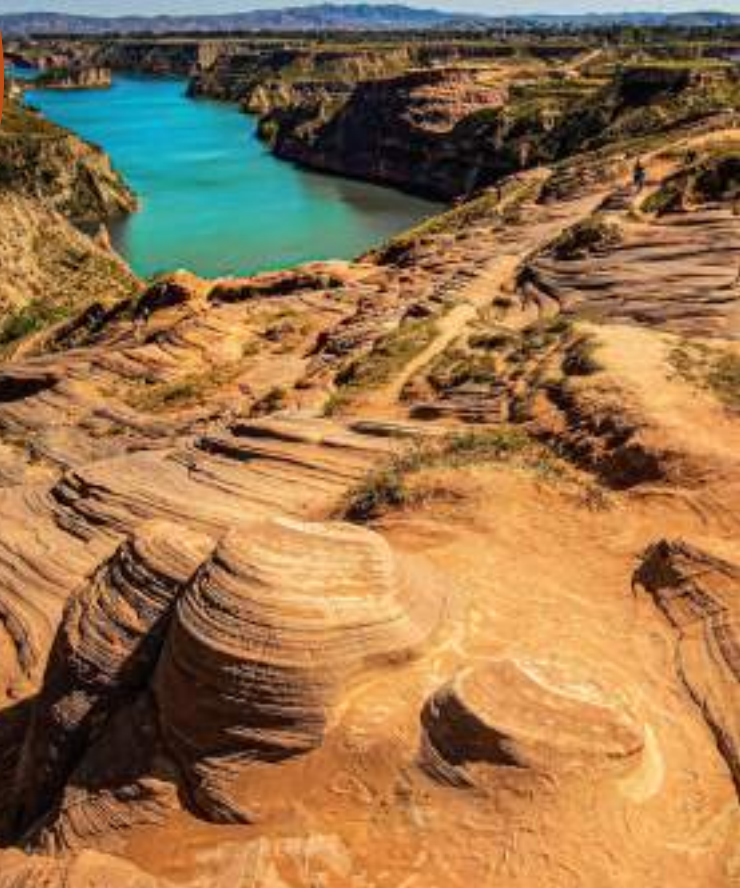
Jingbian Wave Valley 波浪谷景区