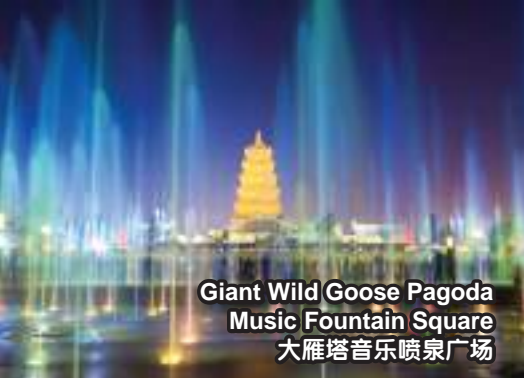
Giant Wild Goose Pagoda Music Fountain Square 大雁塔音乐喷泉广场