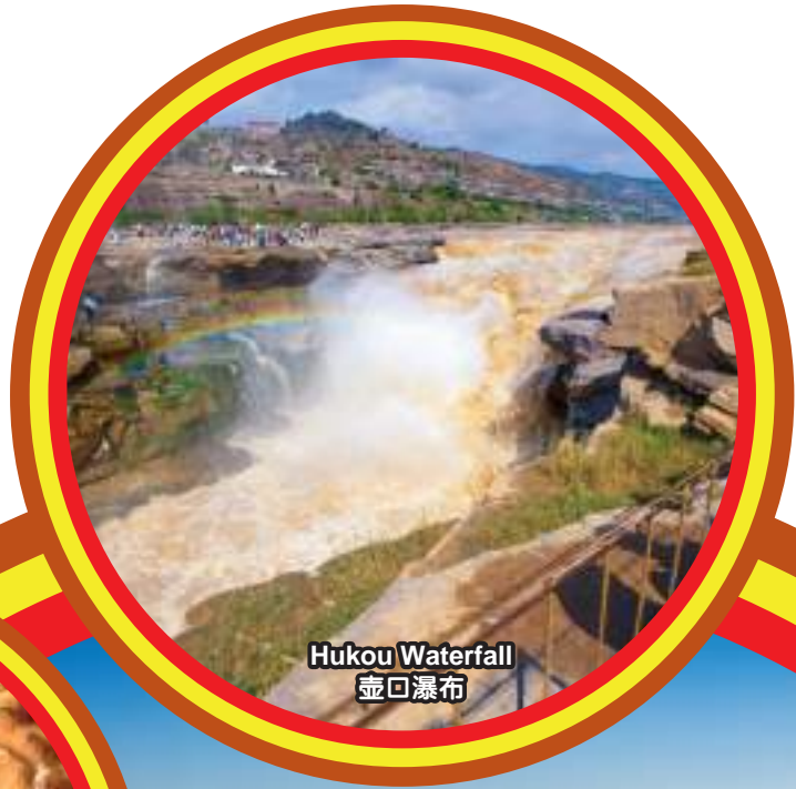
Hukou Waterfall 壶口瀑布