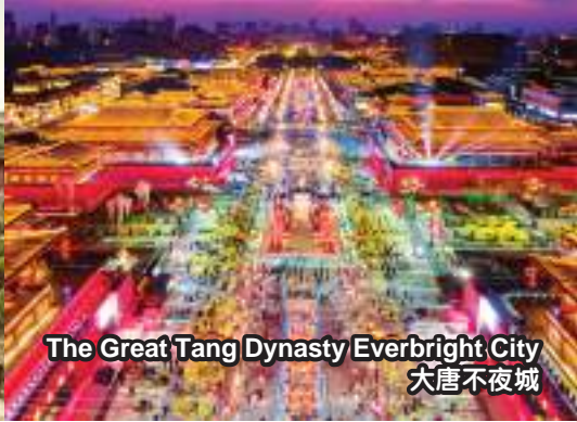
The Great Tang Dynasty Everbright City 大唐不夜城