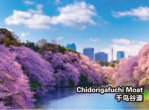
Chidorigafuchi Moat 千鸟谷濠