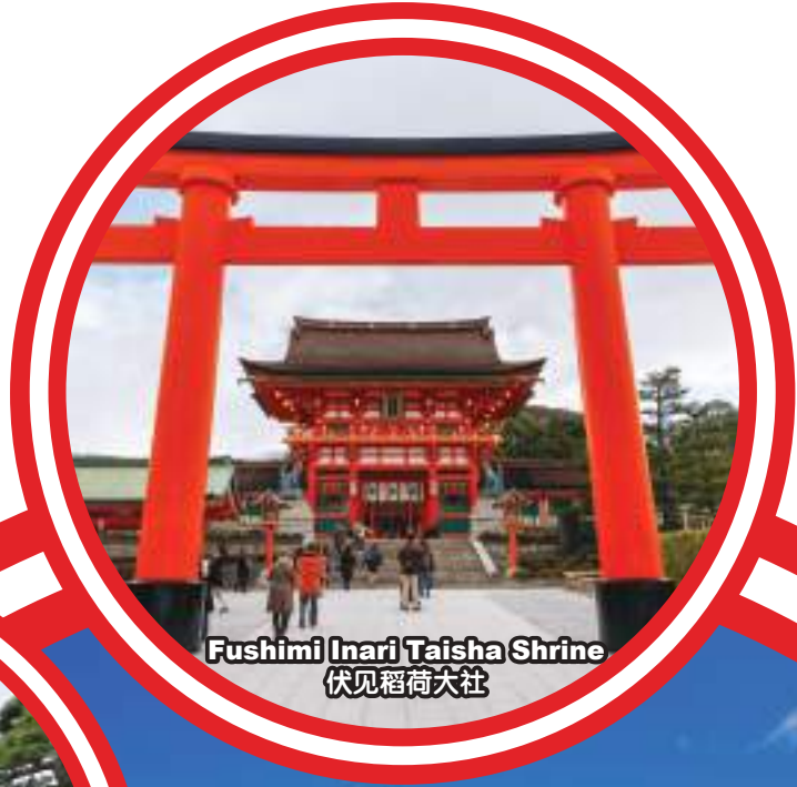
Fushimi Inari Taisha Shrine 伏见稻荷大社