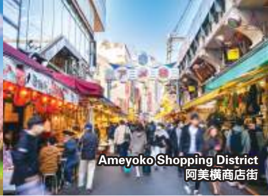
Ameyoko Shopping District 阿美横商店街