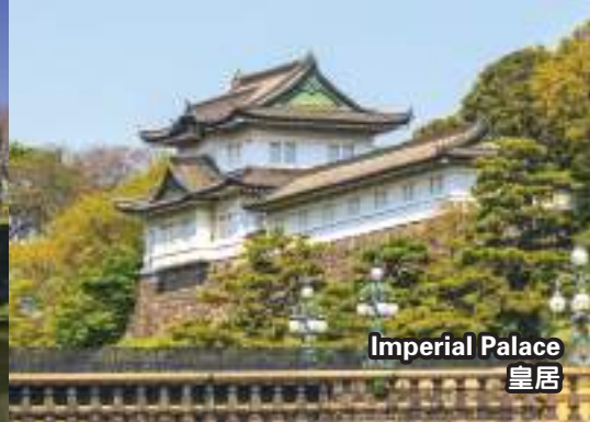
Imperial Palace 皇居