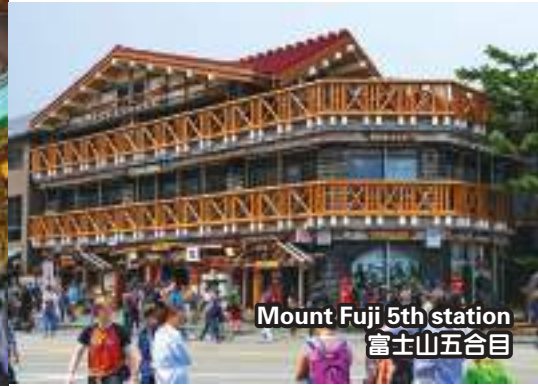
Mount Fuji 5th station 富士山五合目