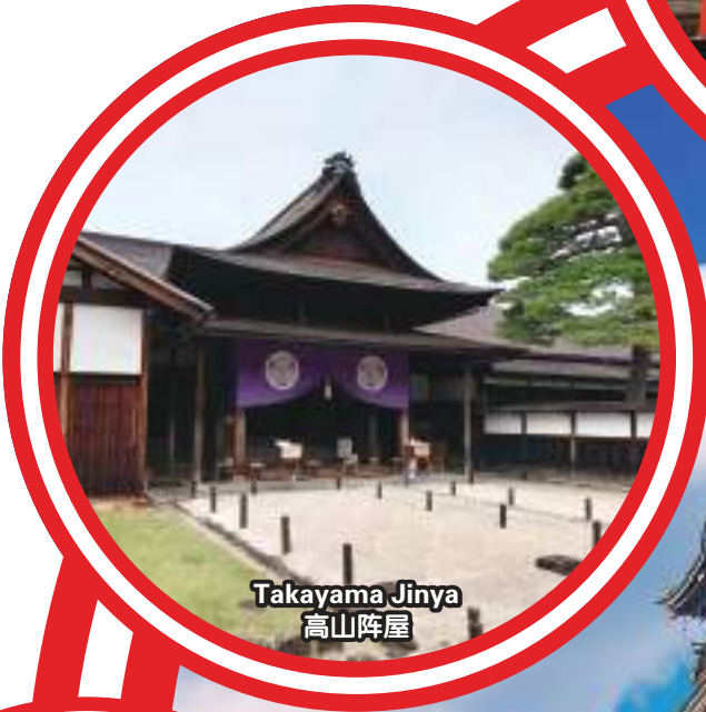
Takayama Jinya 高山阵屋