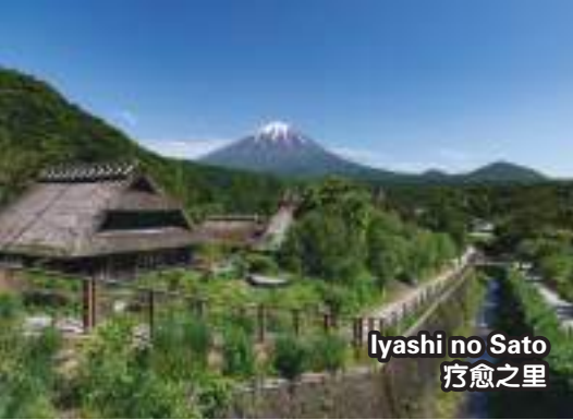
lyashi no Sato 疗愈之里