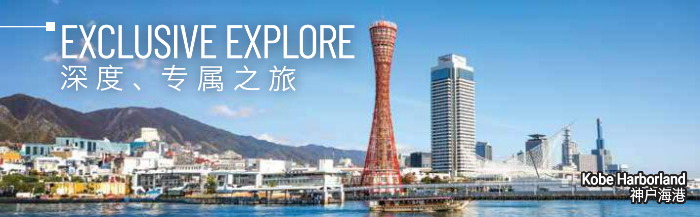
Kobe Harborland 神戸海港