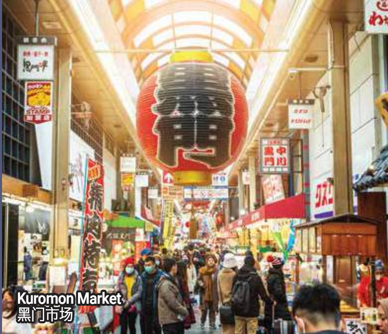
Kuromon Market 黑门市场