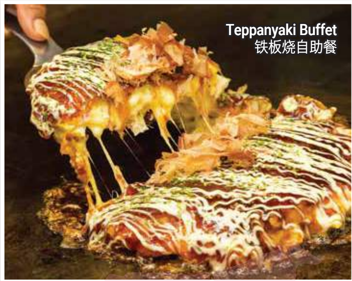
Teppanyaki Buffet 铁板烧自助餐

Deluxe abalone, lobster, scallops, prawns (Japanese pork, beef and chicken all-you-can-eat!) 豪华鲍鱼, 龙虾, 带子, 明虾 (日本豚、牛、鸡肉吃到饱!)