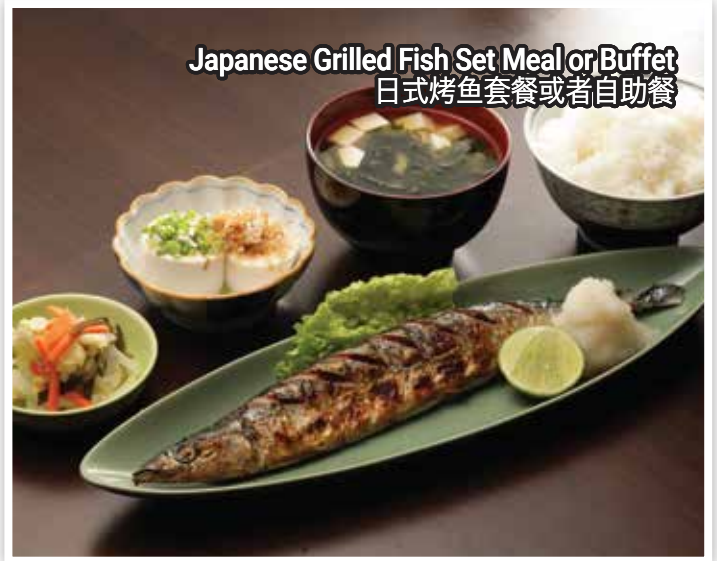
Japanese Grilled Fish Set Meal or Buffet 日式烤鱼套餐或者自助餐