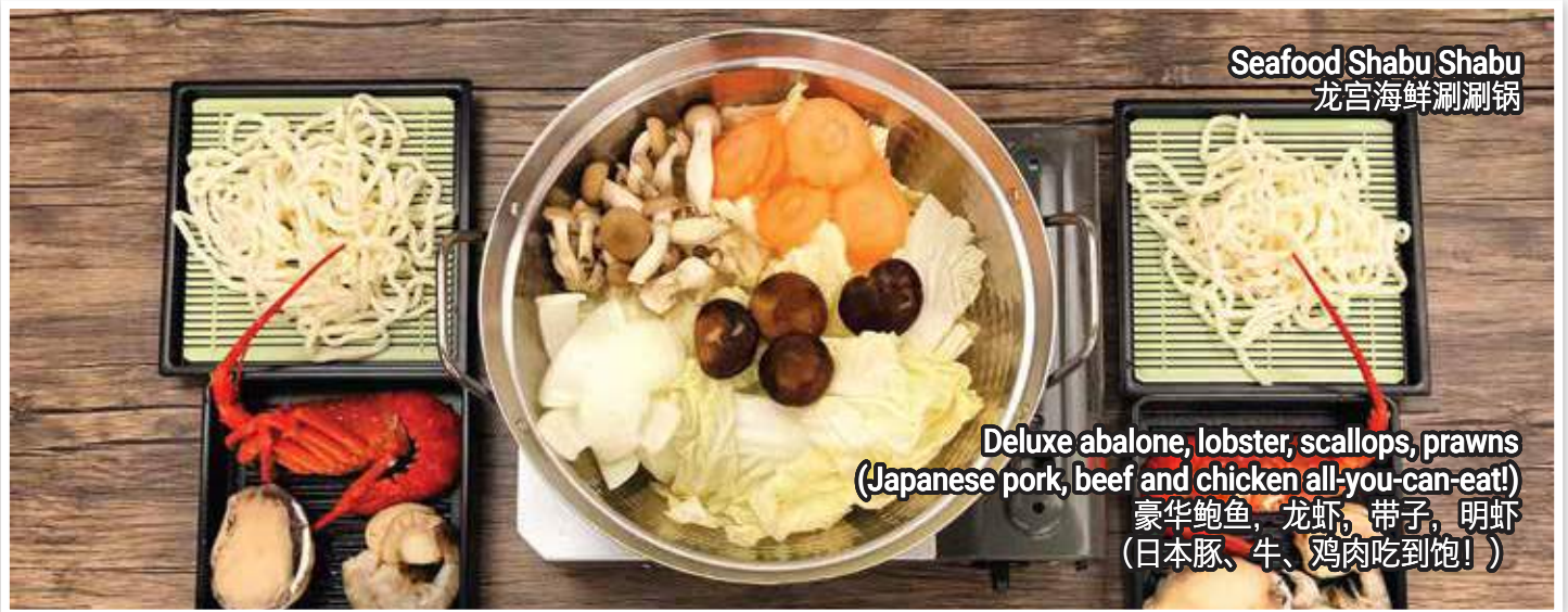
Seafood Shabu Shabu 龙宫海鲜涮涮锅

Deluxe abalone, lobster, scallops, prawns (Japanese pork, beef and chicken all-you-can-eat!) 豪华鲍鱼, 龙虾, 带子, 明虾 (日本豚、牛、鸡肉吃到饱!)