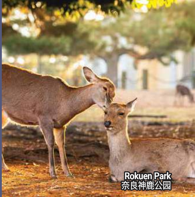
Rokuen Park 奈良神鹿公园