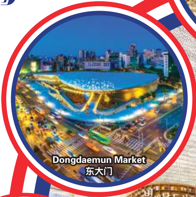
Dongdaemun Market 东大门