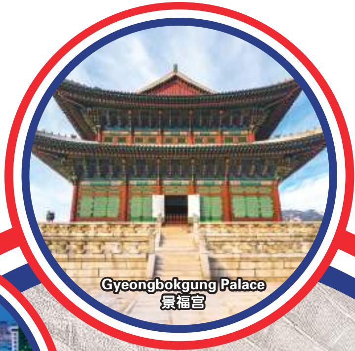
Gyeongbokgung Palace 景福宫