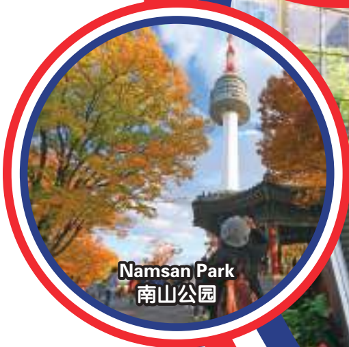
Namsan Park 南山公园