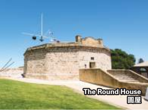
The Round House 圆屋