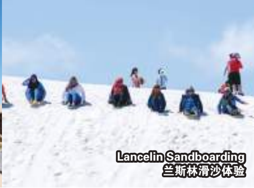
Lancelin Sandboarding 兰斯林滑沙体验