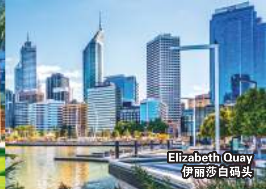
Elizabeth Quay 伊丽莎白码头