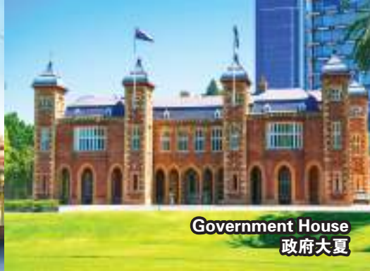
Government House 政府大厦