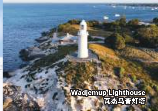
Wadjemup Lighthouse 瓦杰马普灯塔