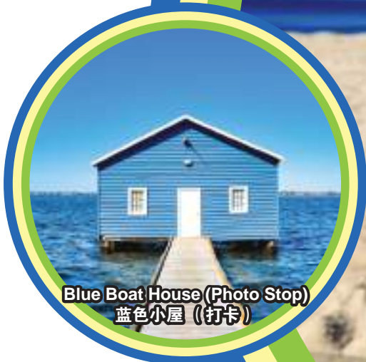
Blue Boat House (Photo Stop) 蓝色小屋 (打卡)