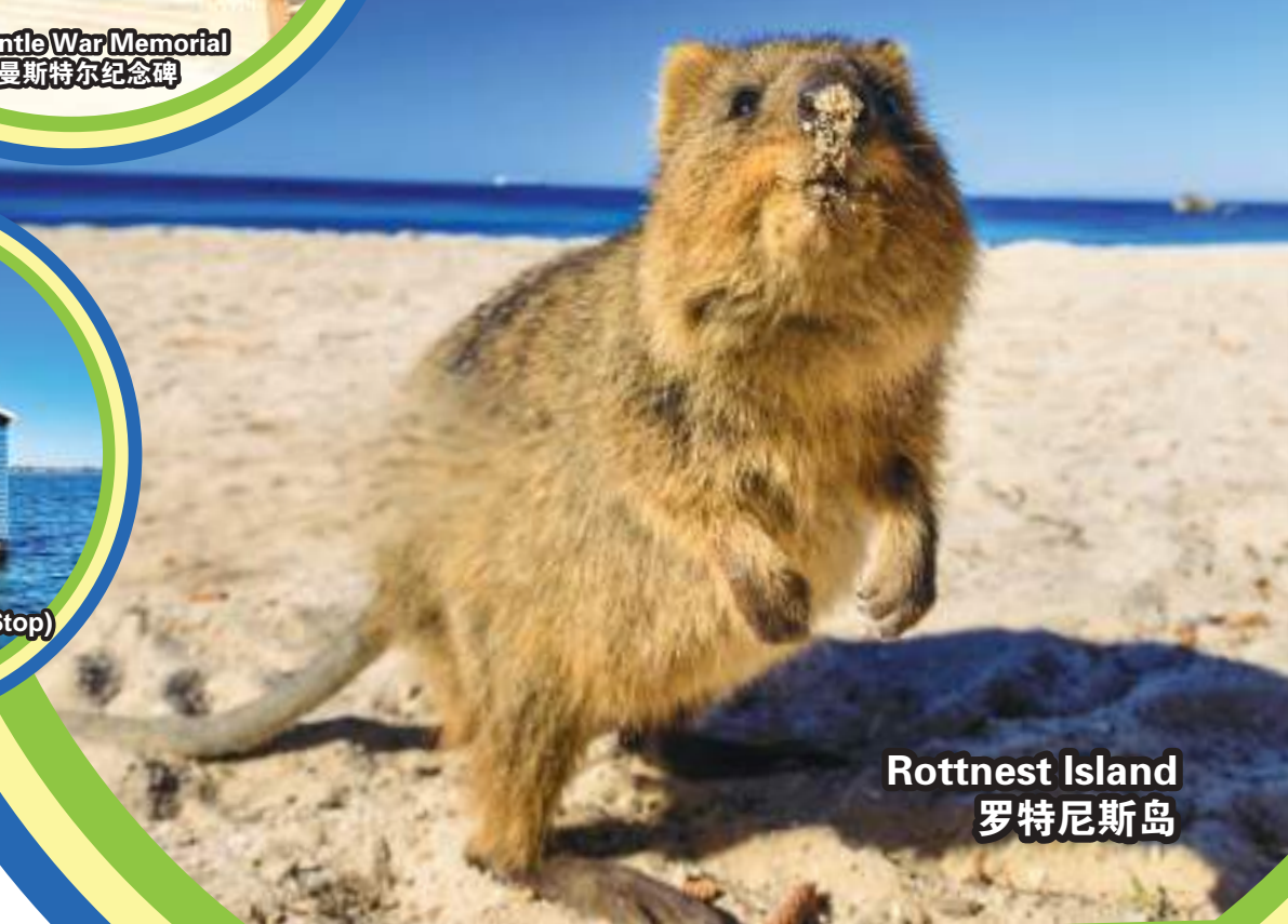
Rottneest Island 罗特尼斯岛