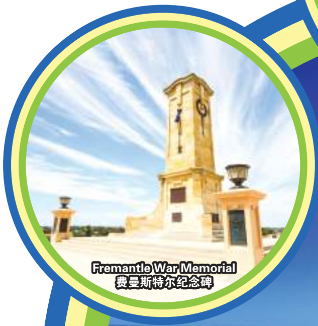
Fremantle War Memorial 费曼斯特尔纪念碑