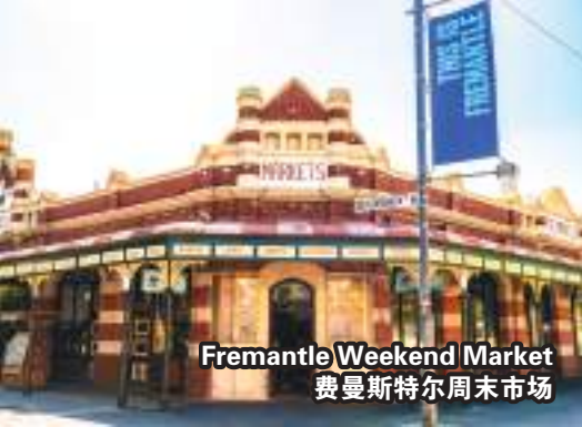
Fremantle Weekend Market 费曼斯特尔周末市场