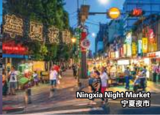
Ningxia Night Market 宁夏夜市