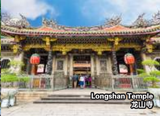
Longshan Temple 龙山寺