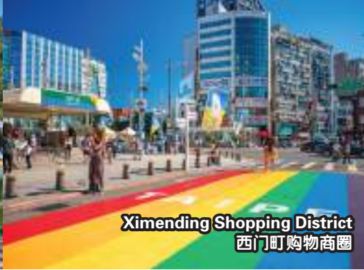
Ximending Shopping District 西门町购物商圈