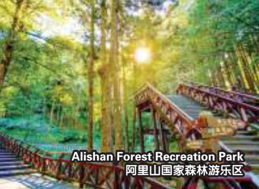
Alishan Forest Recreation Park 阿里山国家森林公园