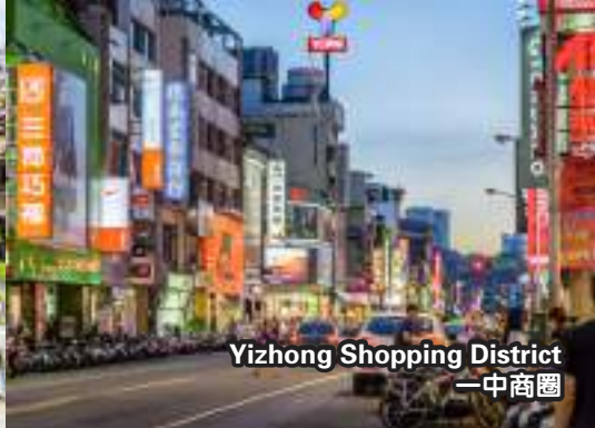
Yizhong Shopping District 一中商圈