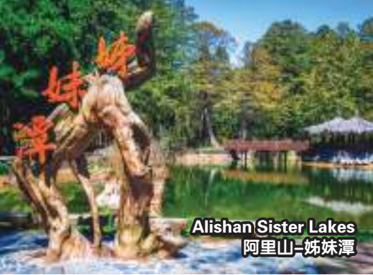
Alishan Sister Lakes 阿里山-姊妹潭