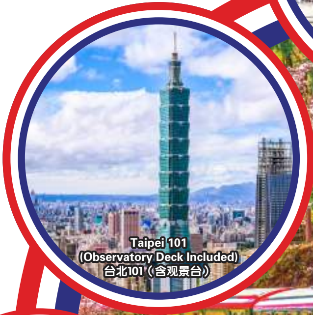
Taipei 101 (Observatory Deck Included) 台北101 (含观景台)