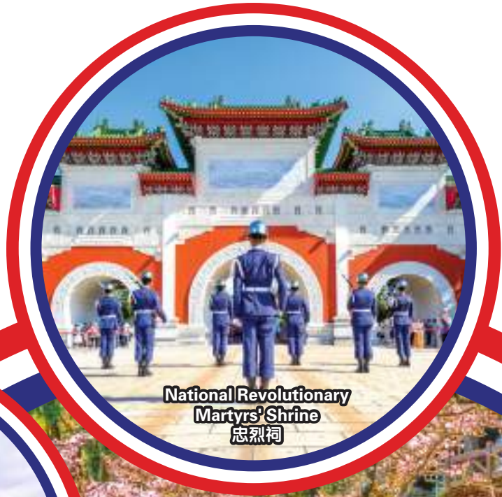
National Revolutionary Martyrs' Shrine 忠烈祠